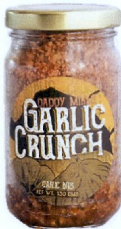
Figure 1. Approved label of DADDY MIKKS GARLIC CRUNCH Garlic Bits, FR-400006984629 issued on 15 January 2021 valid until 15 January 2026

The Food and Drug Administration (FDA) informs the public that the food product DADDY MIKKS GARLIC CRUNCH Garlic Bits has been registered by the Market Authorization Holder (MAH) DADDY MIKKS CHILLI CRUNCH in accordance to existing FDA rules and regulations.