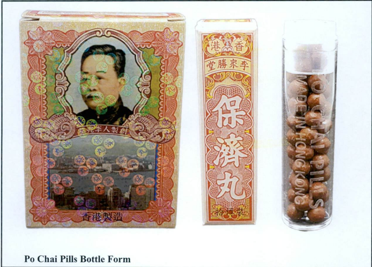
Po Chai Pills Bottle Form