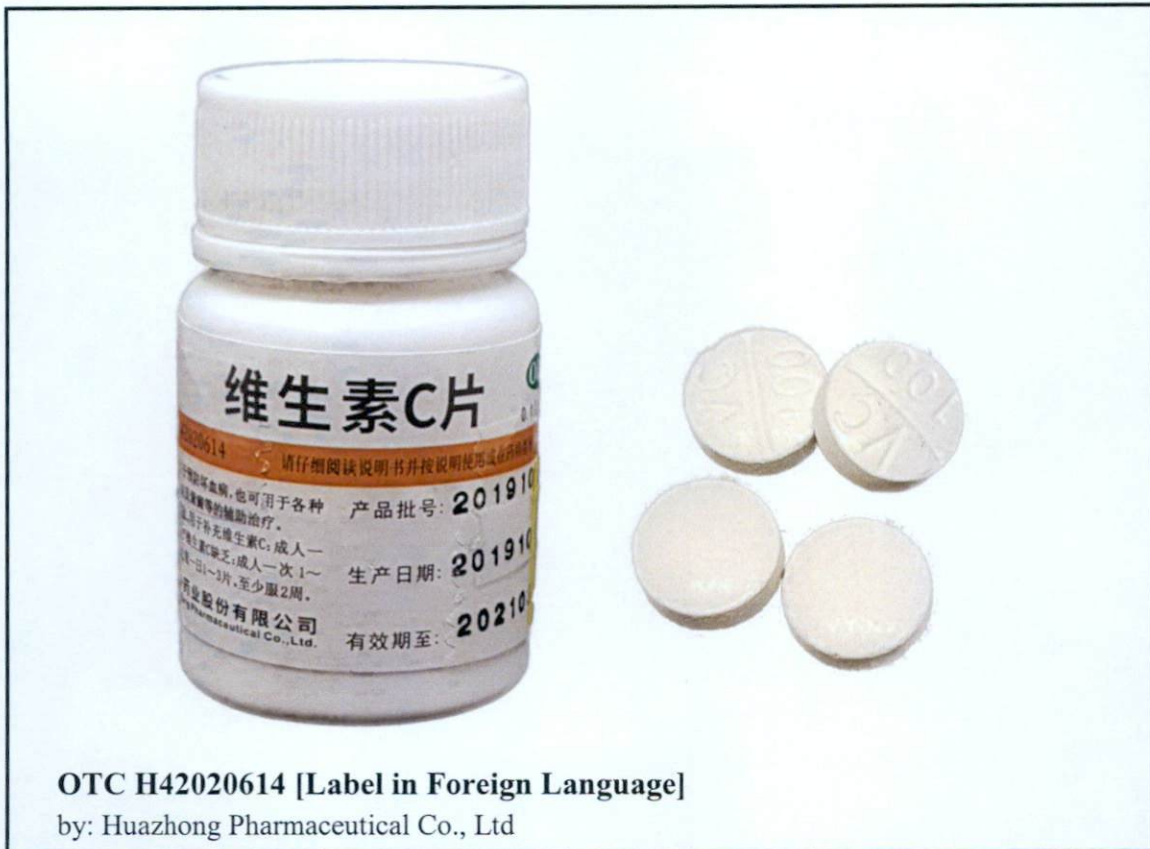
Figure 4. Unregistered drug product

FDA Post-Marketing Surveillance (PMS) activities have verified that the abovementioned drug products have not gone through the registration process of the Agency and have not been issued with proper authorization in the form of Certificate of Product Registration. Thus, the Agency cannot guarantee its quality, safety and efficacy. Therefore, consumption of such violative products may pose potential danger or injury to health.