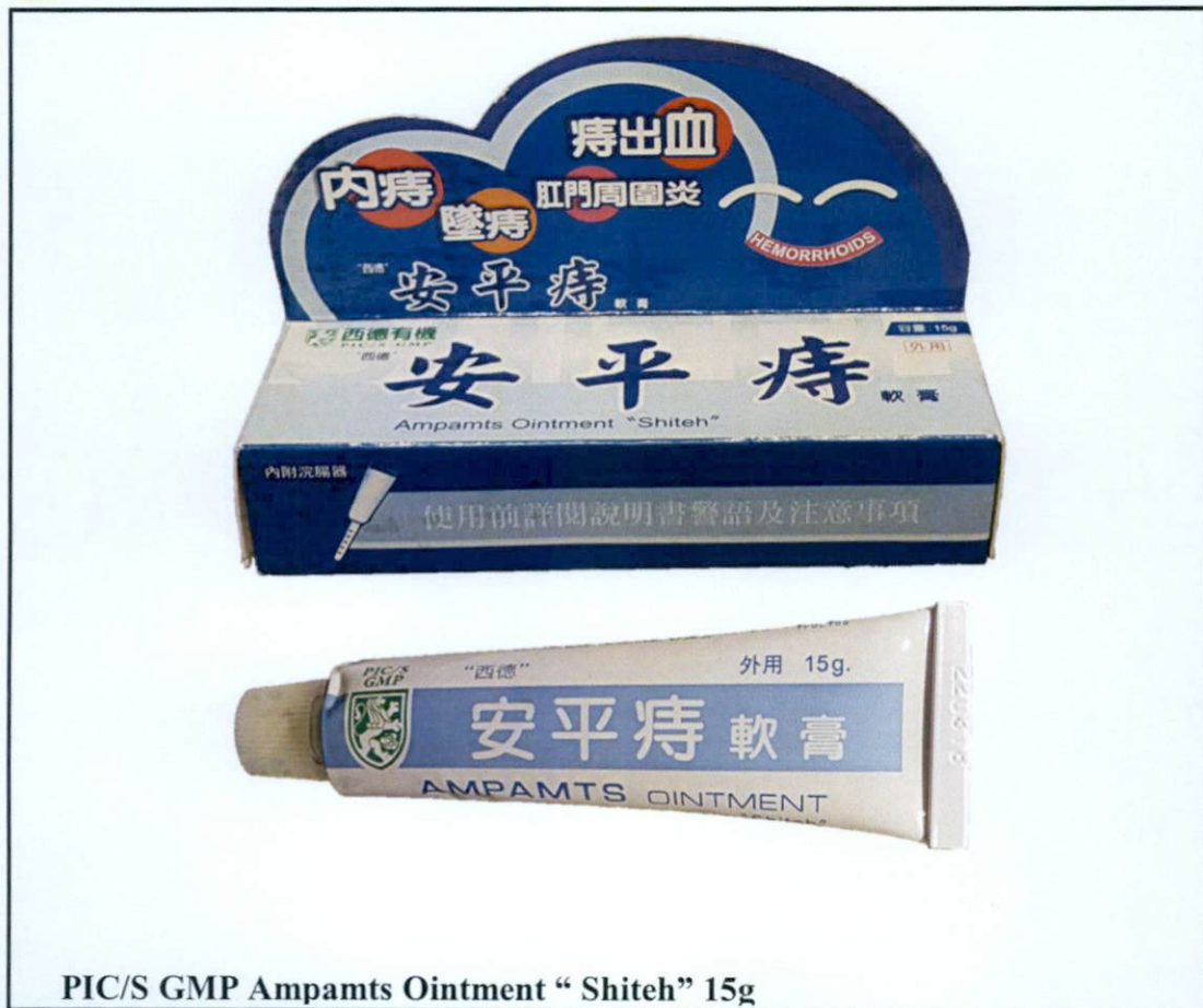
PIC/S GMP Ampamts Ointment "Shiteh" 15g

The Food and Drug Administration (FDA) advises the public against the purchase and use of the following unregistered drug products: