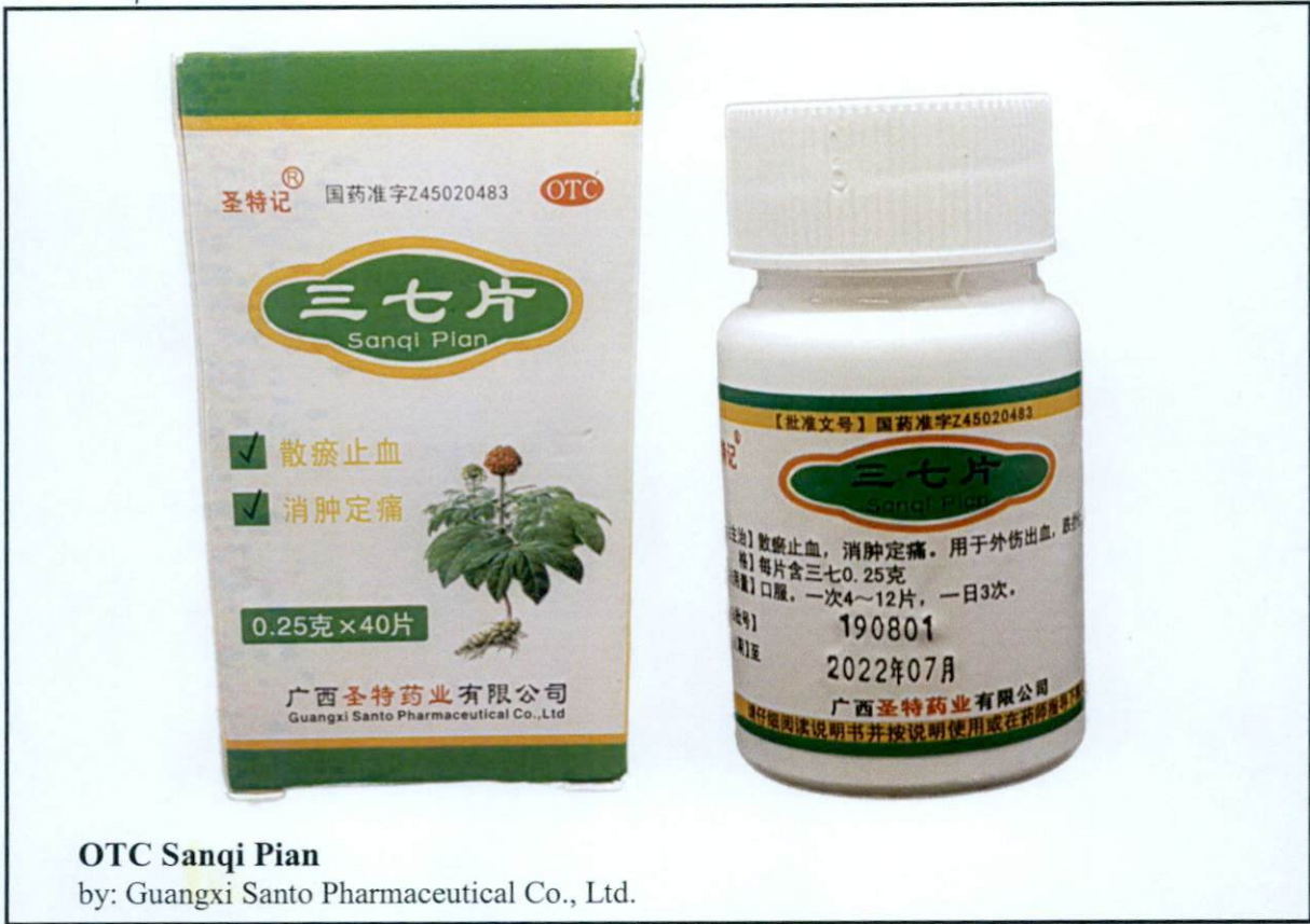
OTC Sanqi Pian by: Guangxi Santo Pharmaceutical Co., Ltd.