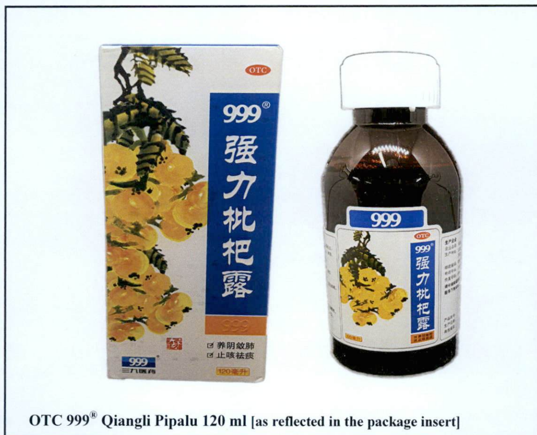
OTC 999 ® Qiangli Pipalu 120 ml [as reflected in the package insert]

The Food and Drug Administration (FDA) advises the public against the purchase and use of the following unregistered drug products: