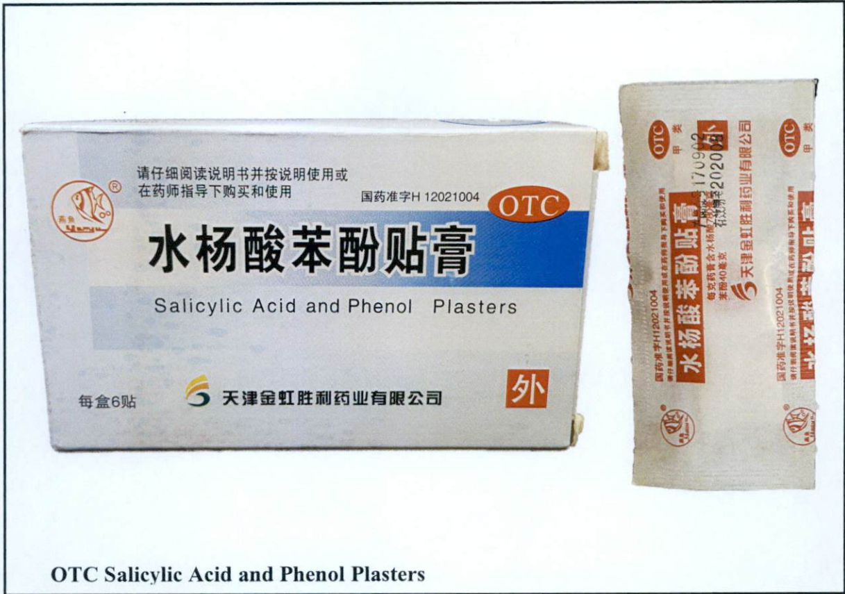
OTC Salicylic Acid and Phenol Plasters