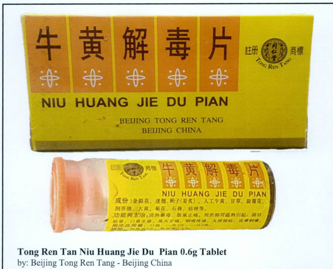
Tong Ren Tan Niu Huang Jie Du Pian 0.6g Tablet by: Beijing Tong Ren Tang - Beijing China

The Food and Drug Administration (FDA) advises the public against the purchase and use of the following unregistered drug products: