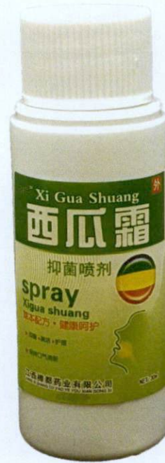
Xi Gua Shuang Spray 30ml by: Jiang Xi zhang Du Yao Ye You Xian Gong Si