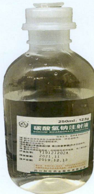
Kelundayaochang® Sodium Bicarbonate Injection 250ml