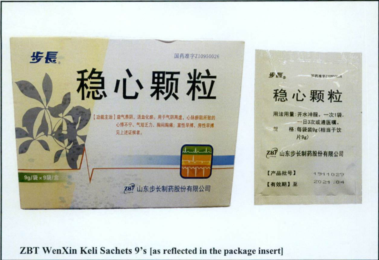
ZBT WenXin Keli Sachets 9's [as reflected in the package insert]