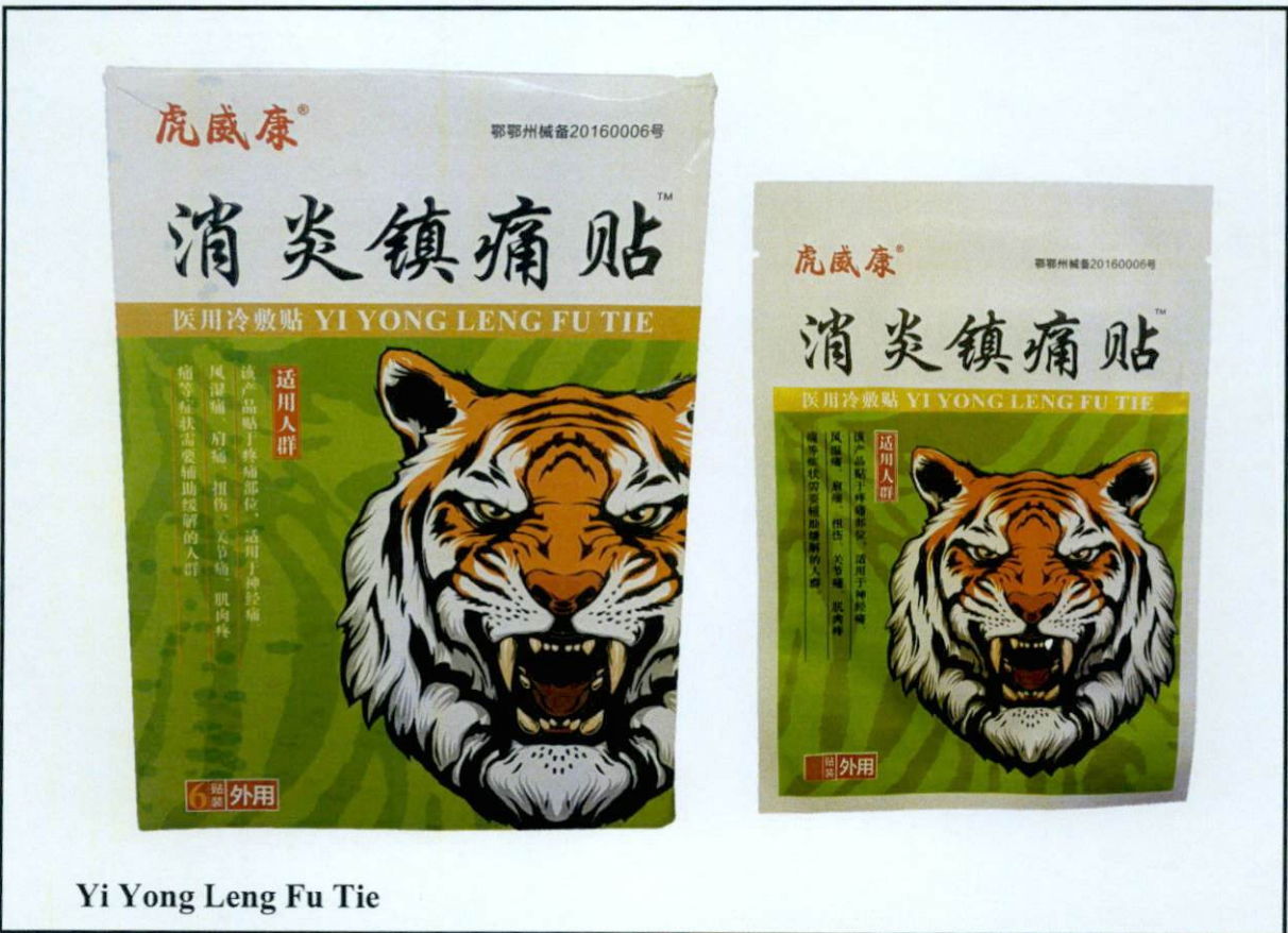
Yi Yong Leng Fu Tie