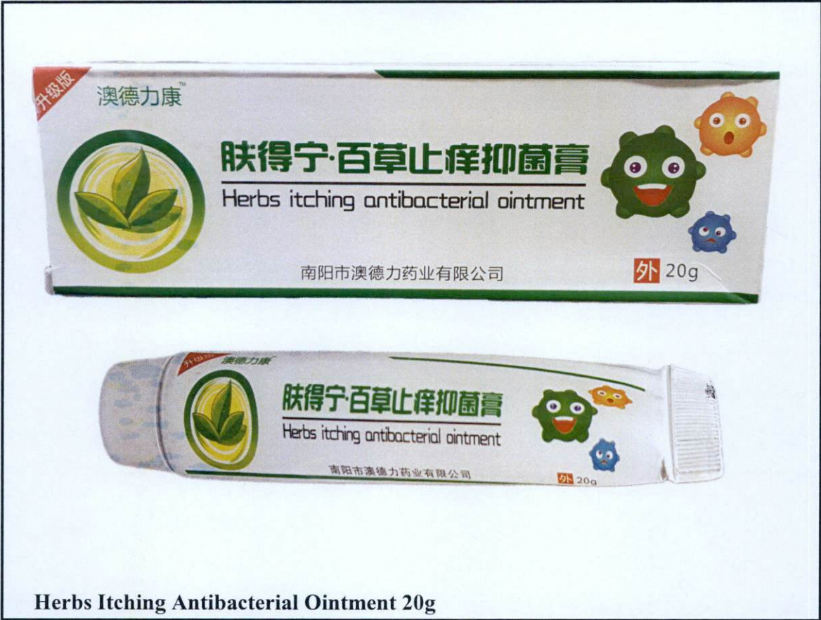
Herbs Itching Antibacterial Ointment 20g