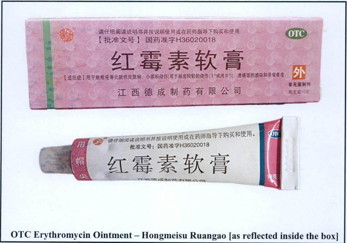
OTC Erythromycin Ointment – Hongmeisu Ruangao [as reflected inside the box]