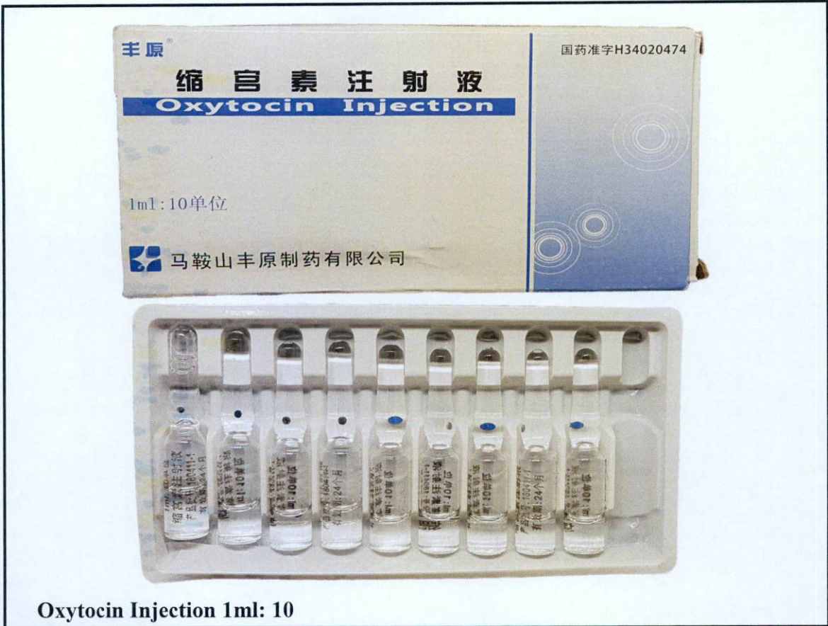
Oxytocin Injection 1ml: 10