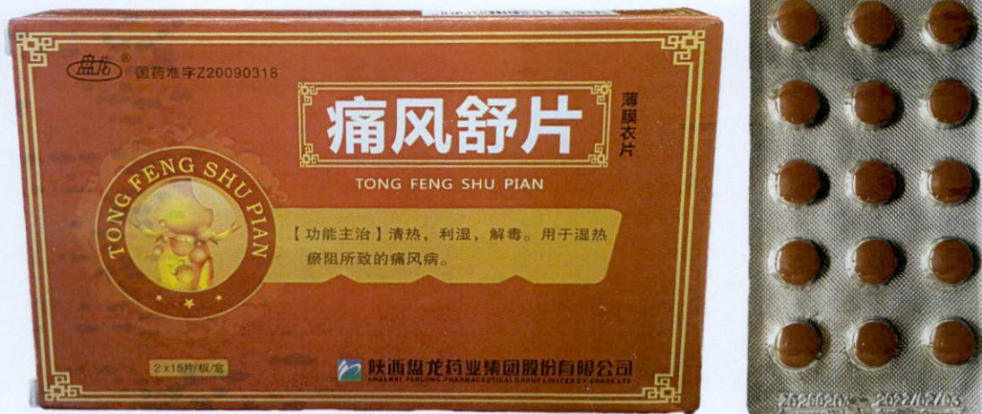
Tong Feng Shu Pian