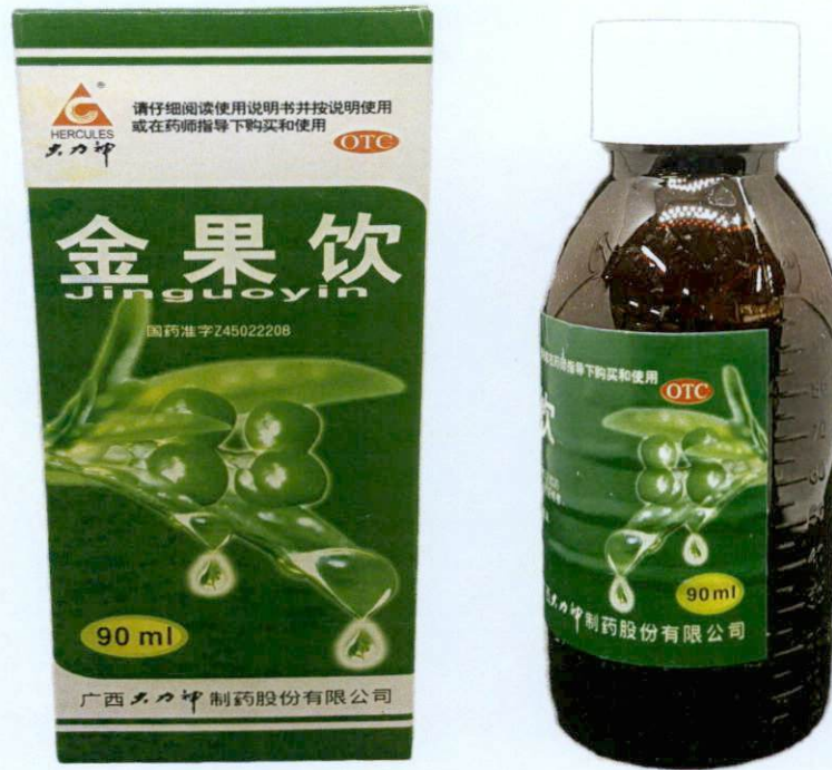
OTC Hercules® Jinguoyin 90 ml