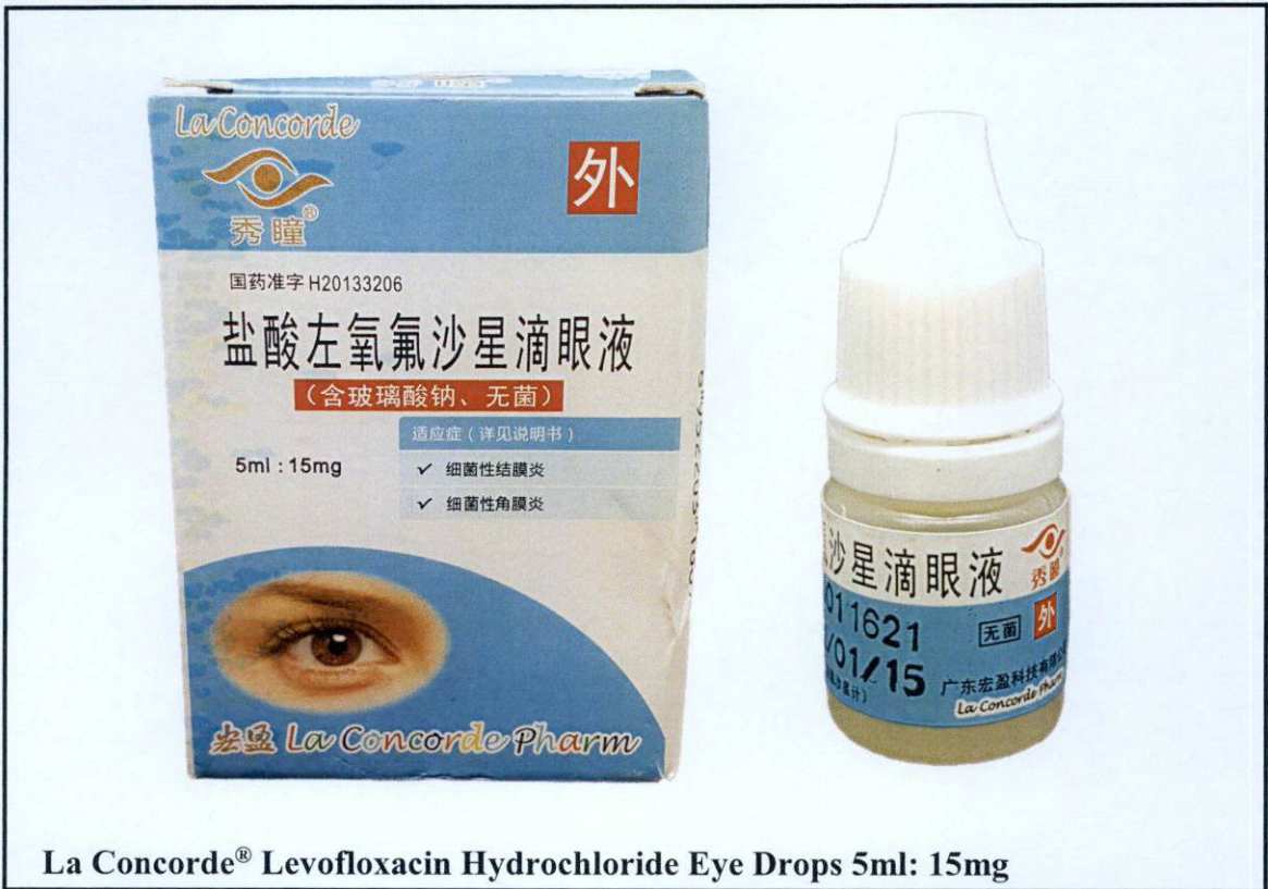
La Concorde® Levofloxacin Hydrochloride Eye Drops 5ml: 15mg