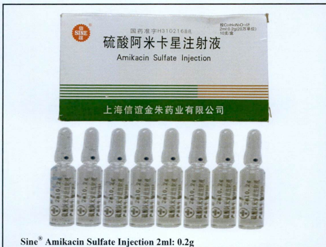
Sine ® Amikacin Sulfate Injection 2ml: 0.2g

The Food and Drug Administration (FDA) advises the public against the purchase and use of the following unregistered drug products: