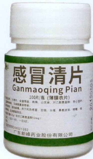
Xinfeng Yaoye® Ganmaoqing Pian