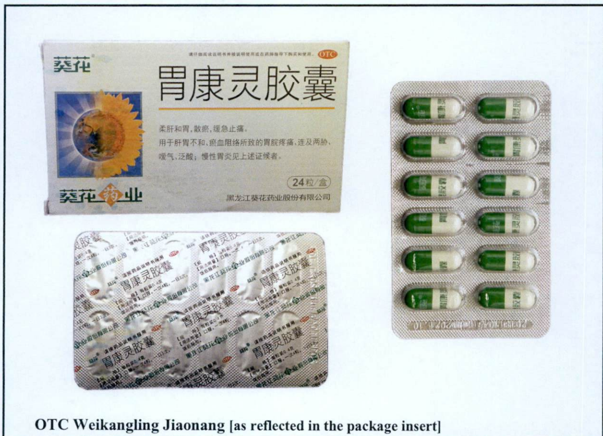
OTC Weikangling Jiaonang [as reflected in the package insert]