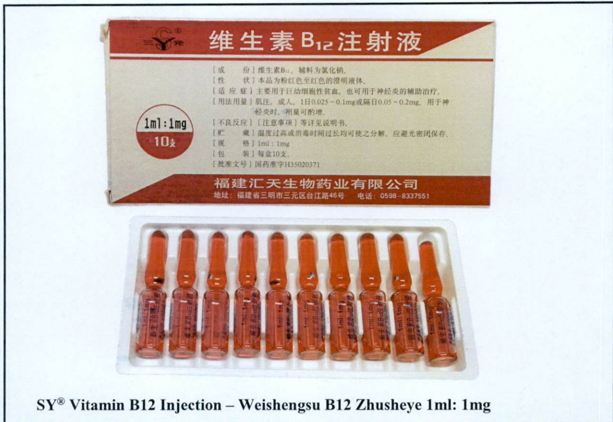
SY® Vitamin B12 Injection – Weishengsu B12 Zhusheye 1ml: 1mg