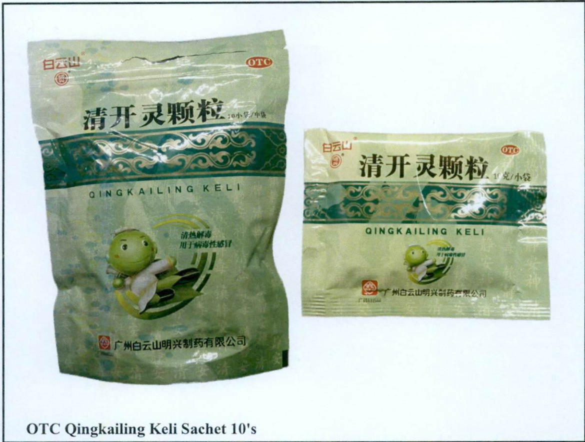
OTC Qingkailing Keli Sachet 10's