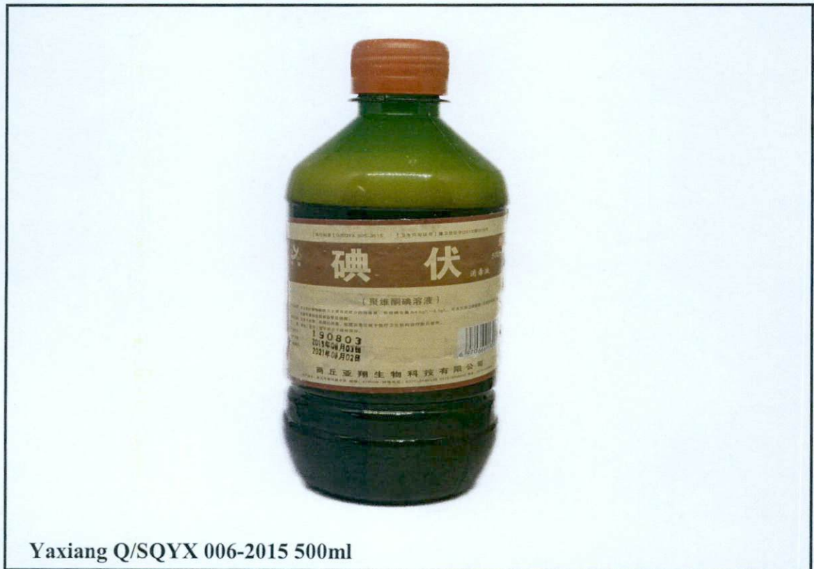
Yaxiang Q/SQYX 006-2015 500ml