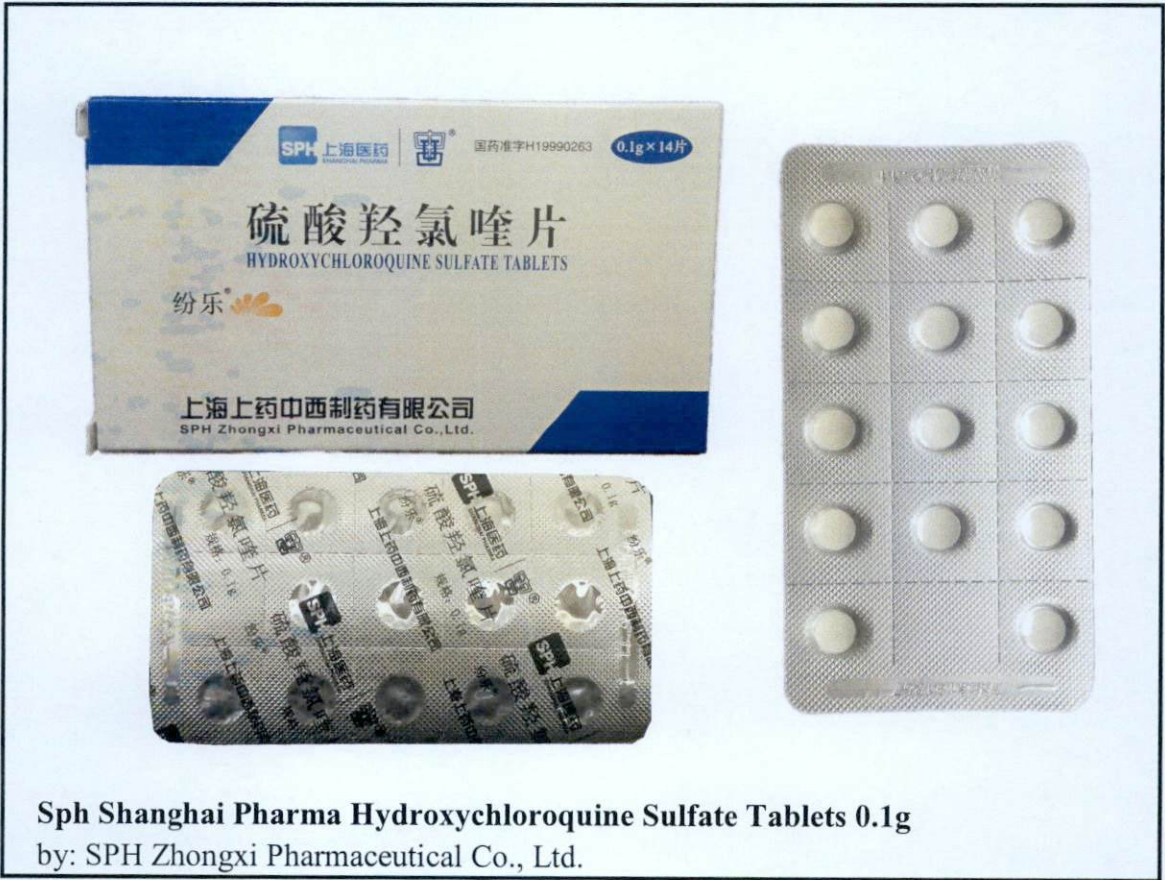
Sph Shanghai Pharma Hydroxychloroquine Sulfate Tablets 0.1g by: SPH Zhongxi Pharmaceutical Co., Ltd.