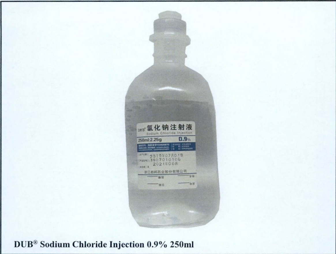
DUB® Sodium Chloride Injection 0.9% 250ml