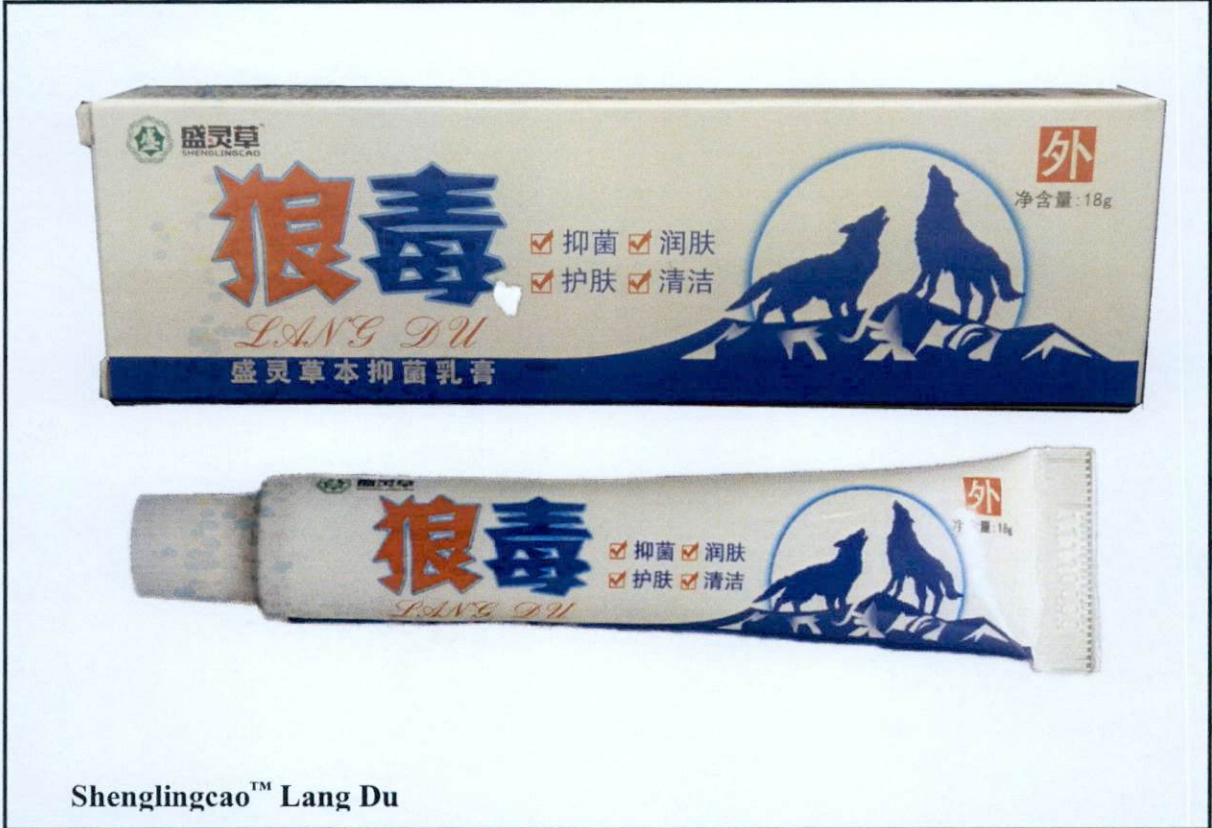
Shenglingcao™ Lang Du