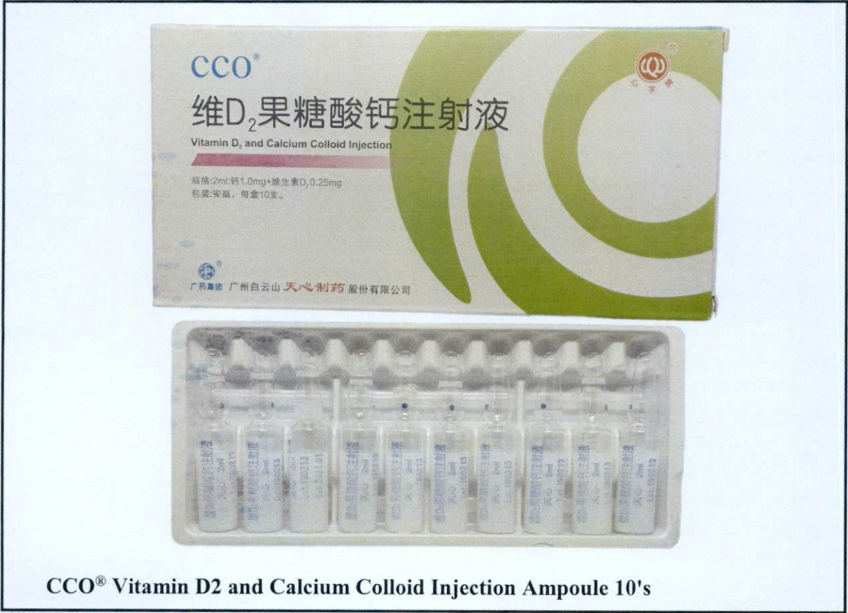
CCO® Vitamin D 2 and Calcium Colloid Injection Ampoule 10's