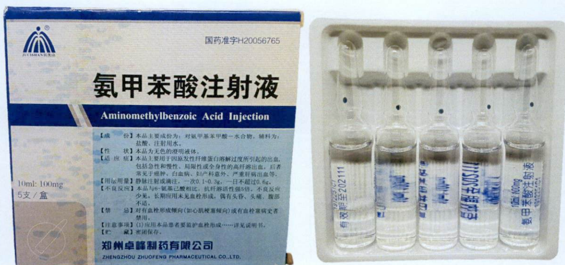
Jucishan® Aminomethylbenzoic Acid Injection 10ml: 100mg by: Zhengzhou Zhuofeng Pharmaceutical Co., Ltd.