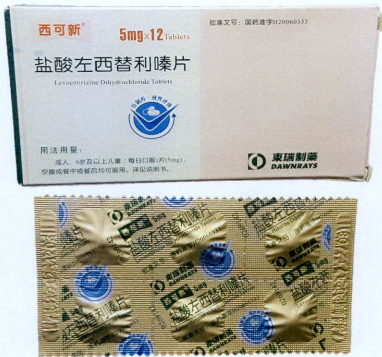
Dawnrays Levocetirizine Dihydrochloride Tablets 5mg