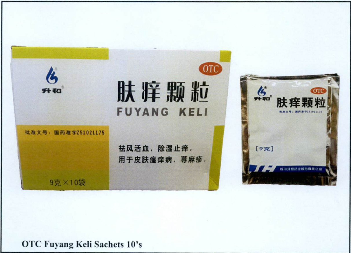
OTC Fuyang Keli Sachets 10's