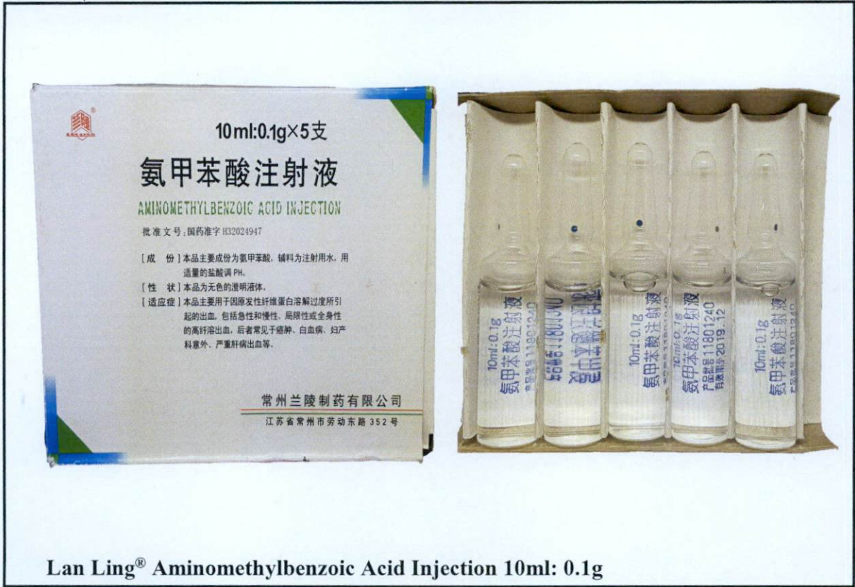
Lan Ling® Aminomethylbenzoic Acid Injection 10ml: 0.1g