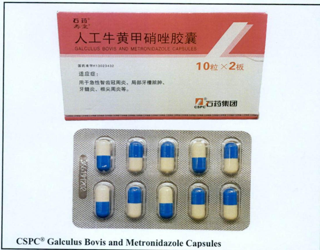
CSPC® Galculus Bovis and Metronidazole Capsules

The Food and Drug Administration (FDA) advises the public against the purchase and use of the following unregistered drug products: