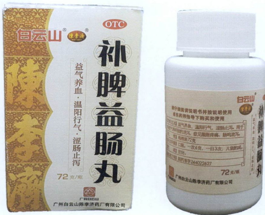
OTC Bupi Yichang Wan [as reflected in the package insert]