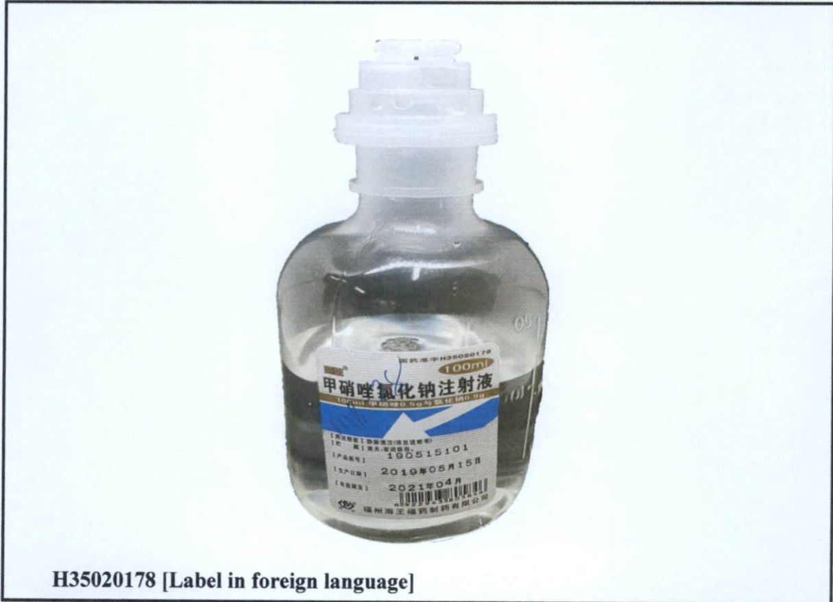
H35020178 [Label in foreign language]