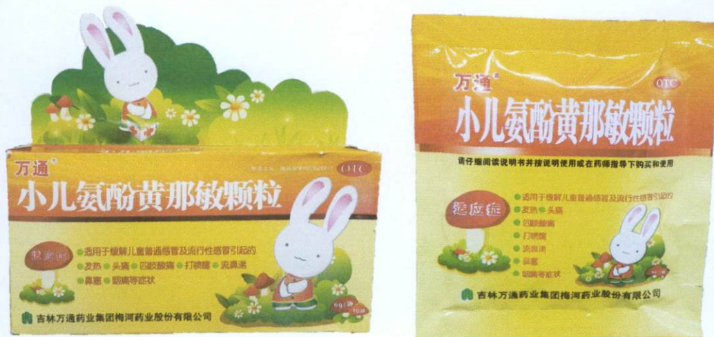
OTC WT ® Pediatric Paracetamol, Artificial Cow-bezoar and Chlorphenamine Maleate Granules