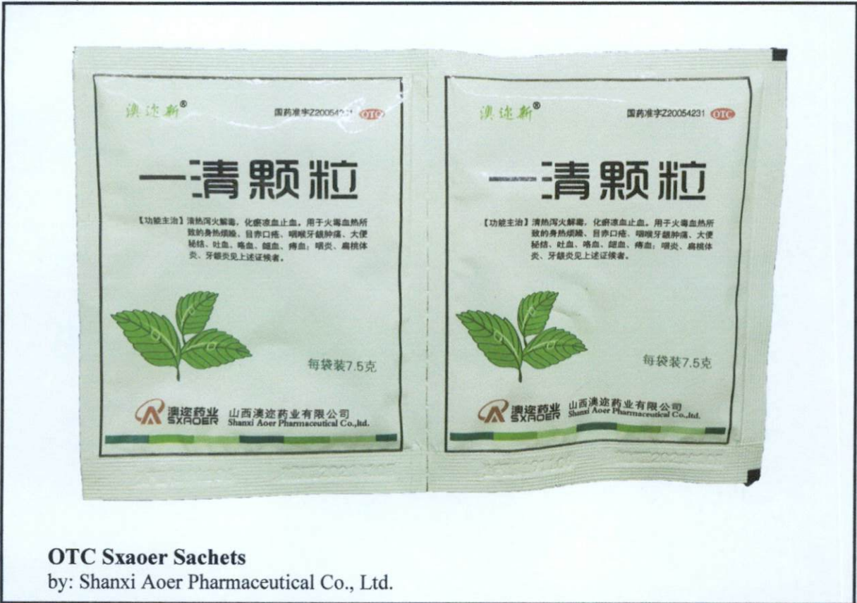
OTC Sxaoer Sachets by: Shanxi Aoer Pharmaceutical Co., Ltd.