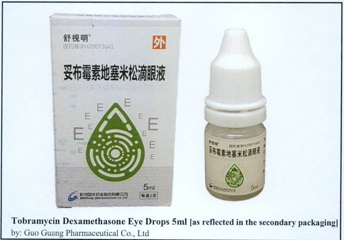
Tobramycin Dexamethasone Eye Drops 5ml [as reflected in the secondary packaging] by: Guo Guang Pharmaceutical Co., Ltd