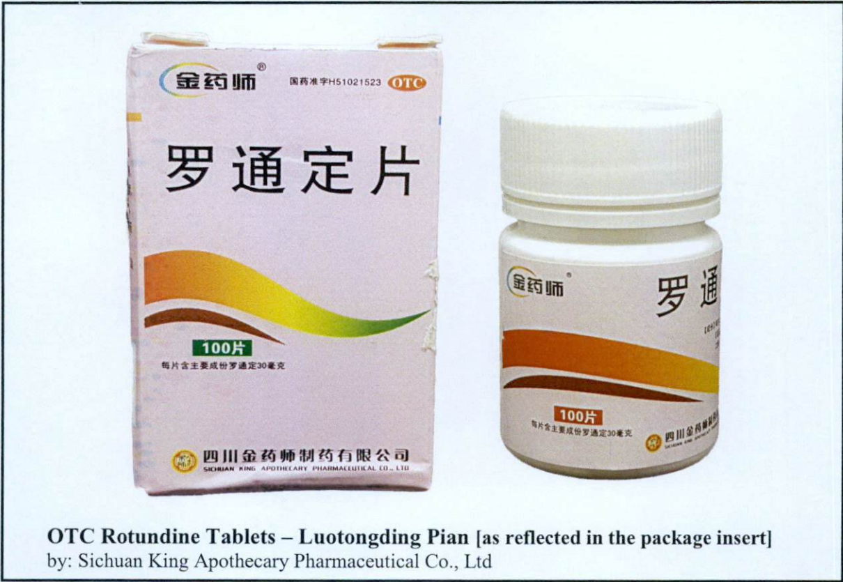
Figure 2. Unregistered drug product