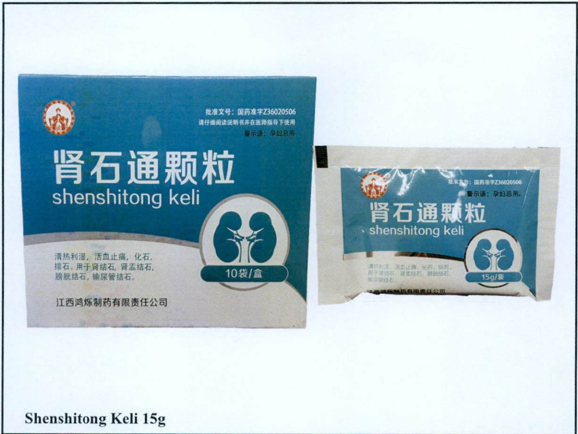
Shenshitong Keli 15g