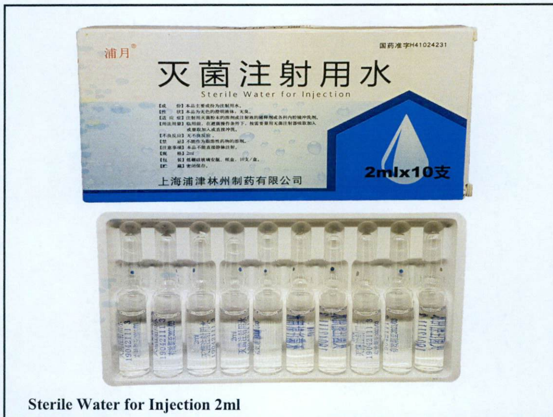
Sterile Water for Injection 2ml

The Food and Drug Administration (FDA) advises the public against the purchase and use of the following unregistered drug products: