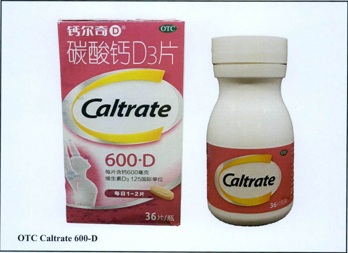
Figure 3. Unregistered drug product