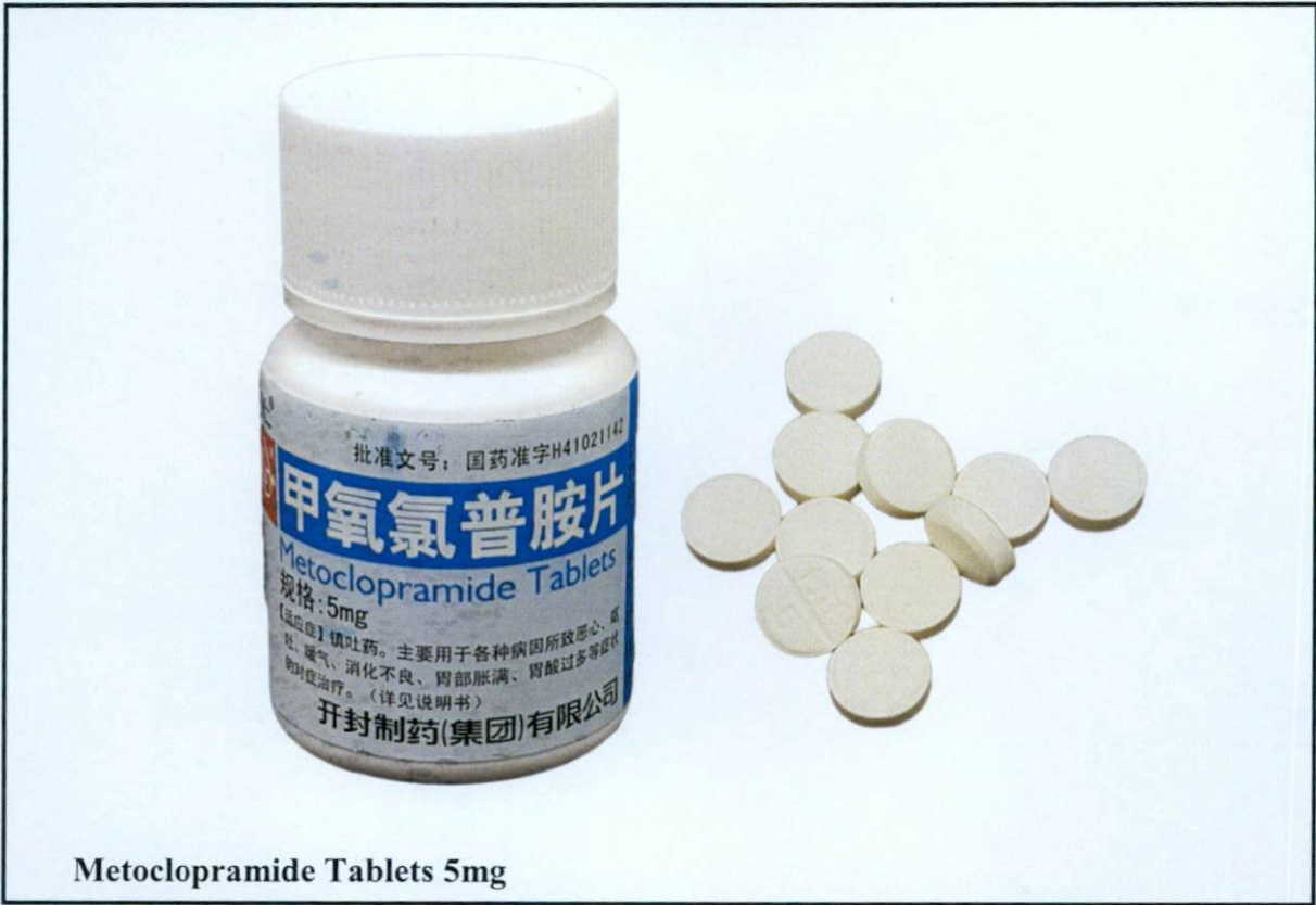
Metoclopramide Tablets 5mg