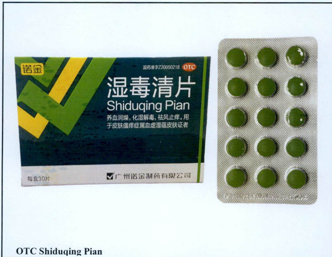
OTC Shiduoqing Pian

The Food and Drug Administration (FDA) advises the public against the purchase and use of the following unregistered drug products: