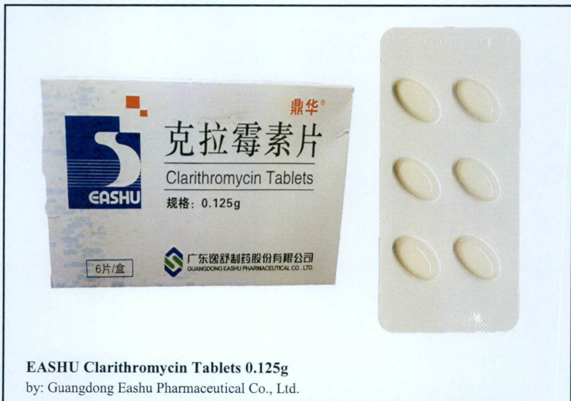
EASHU Clarithromycin Tablets 0.125g