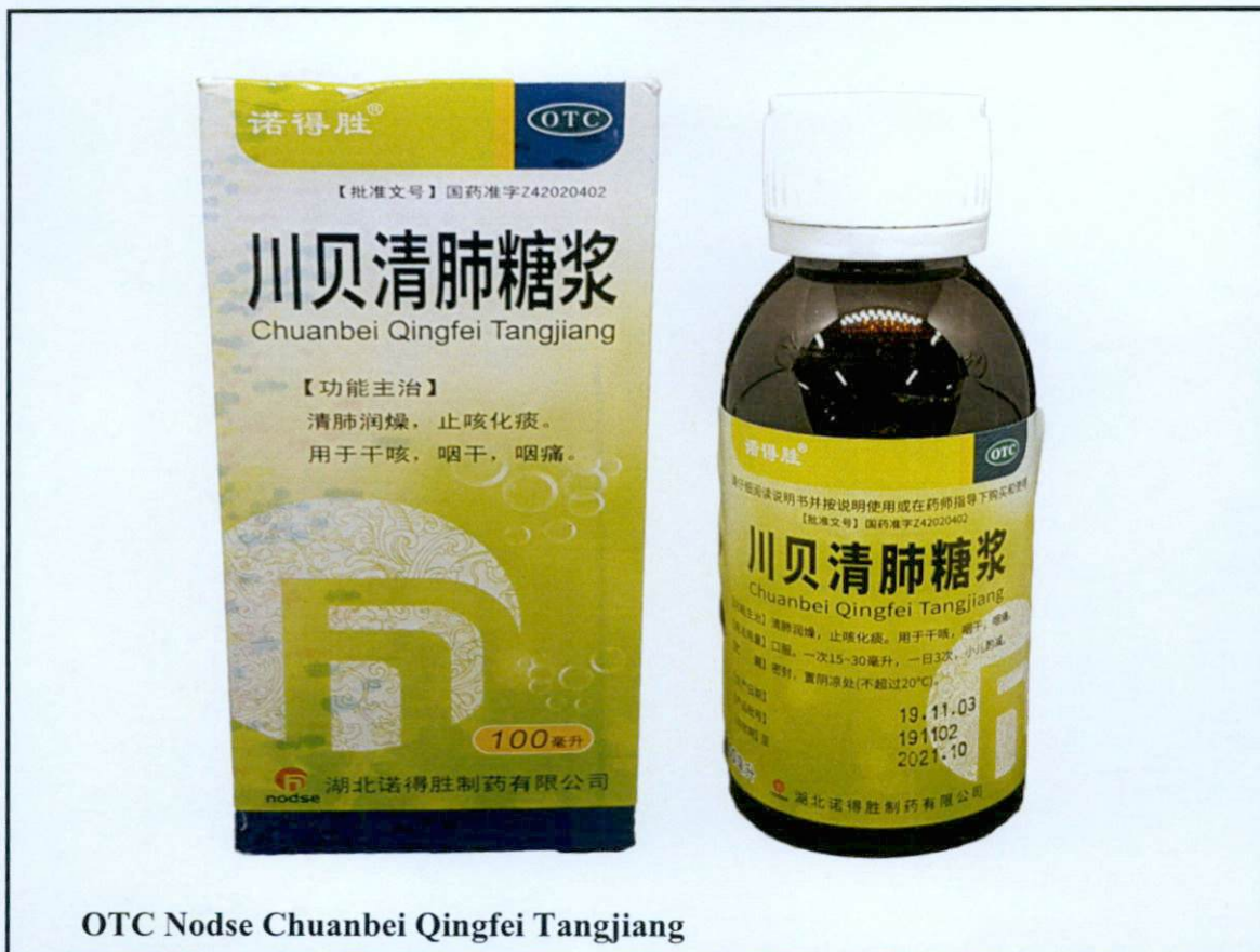
OTC Nodse Chuanbei Qingfei Tangjiang