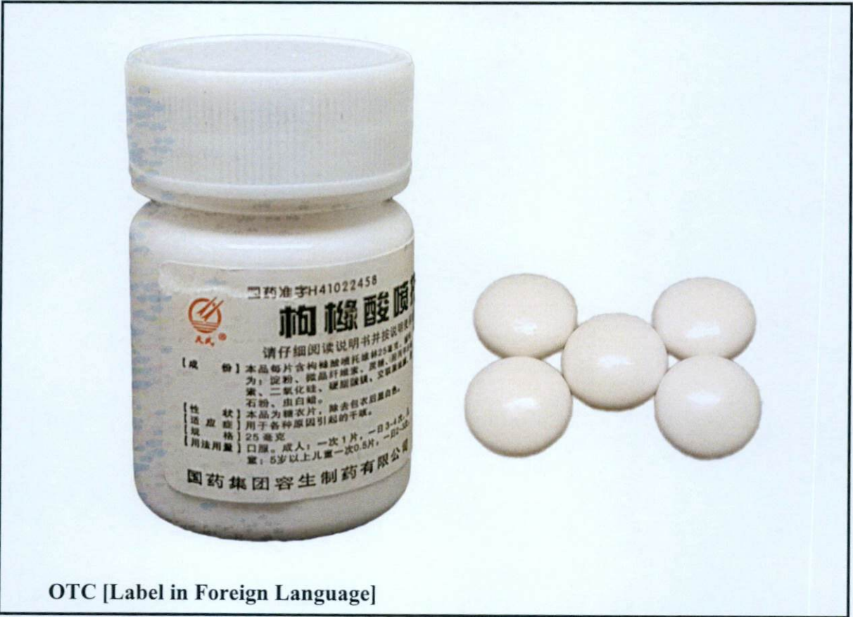
OTC [Label in Foreign Language]