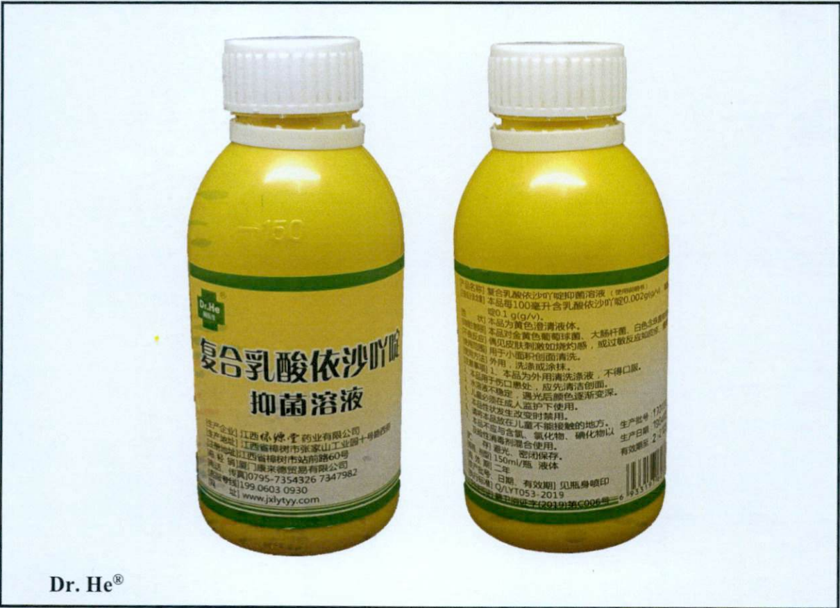
Figure 3. Unregistered drug product