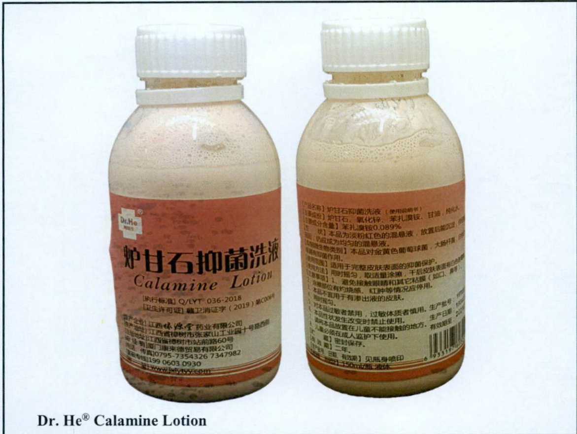
Dr. He® Calamine Lotion