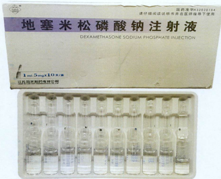
Lian Yao® Dexamethasone Sodium Phosphate Injection 1ml: 5mg by: Jiang Su Lian Shui Pharmaceutical Co., Ltd