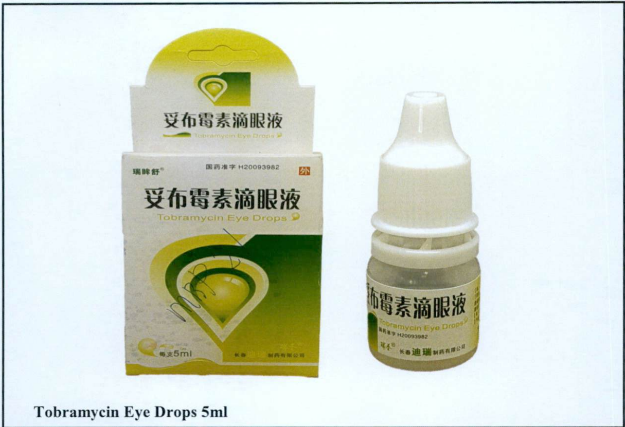
Tobramycin Eye Drops 5ml