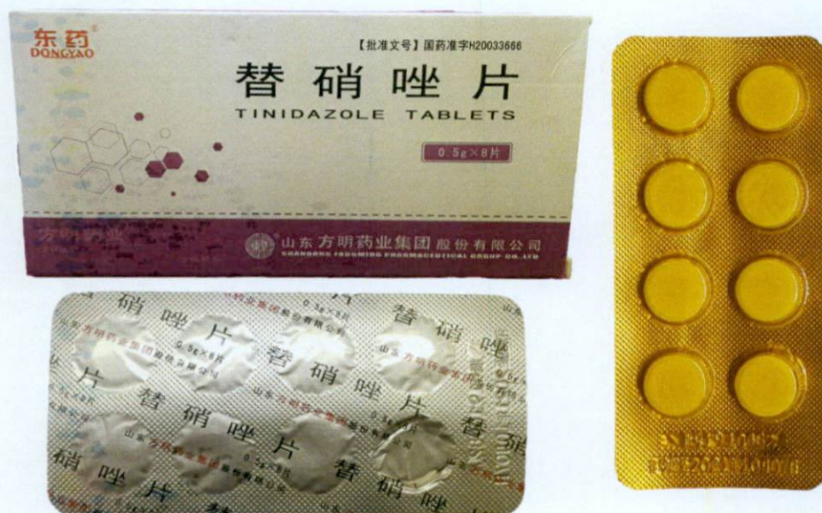
Dongyao® Tinidazole Tablets 0.5g by: Shandong Fangming Pharmaceutical Group Co., Ltd.