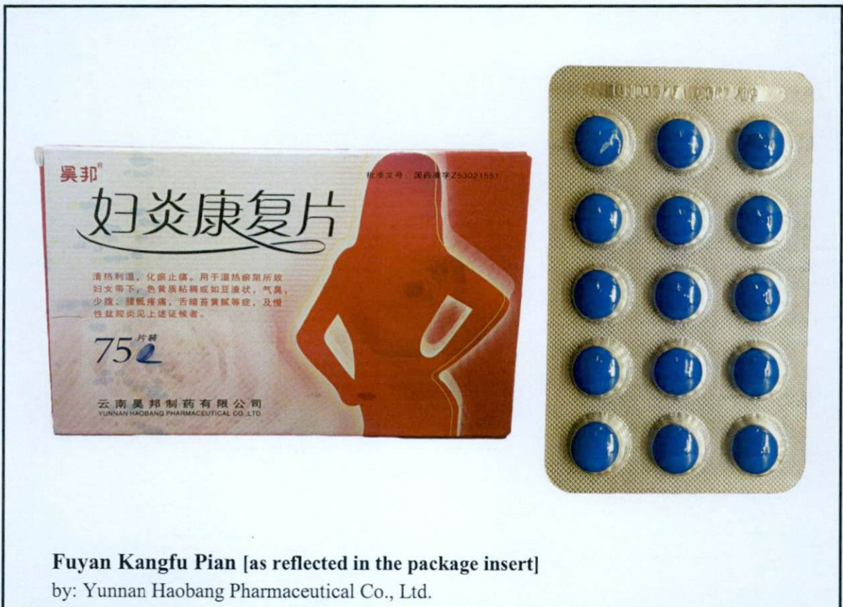
Fuyan Kangfu Pian [as reflected in the package insert] by: Yunnan Haobang Pharmaceutical Co., Ltd.