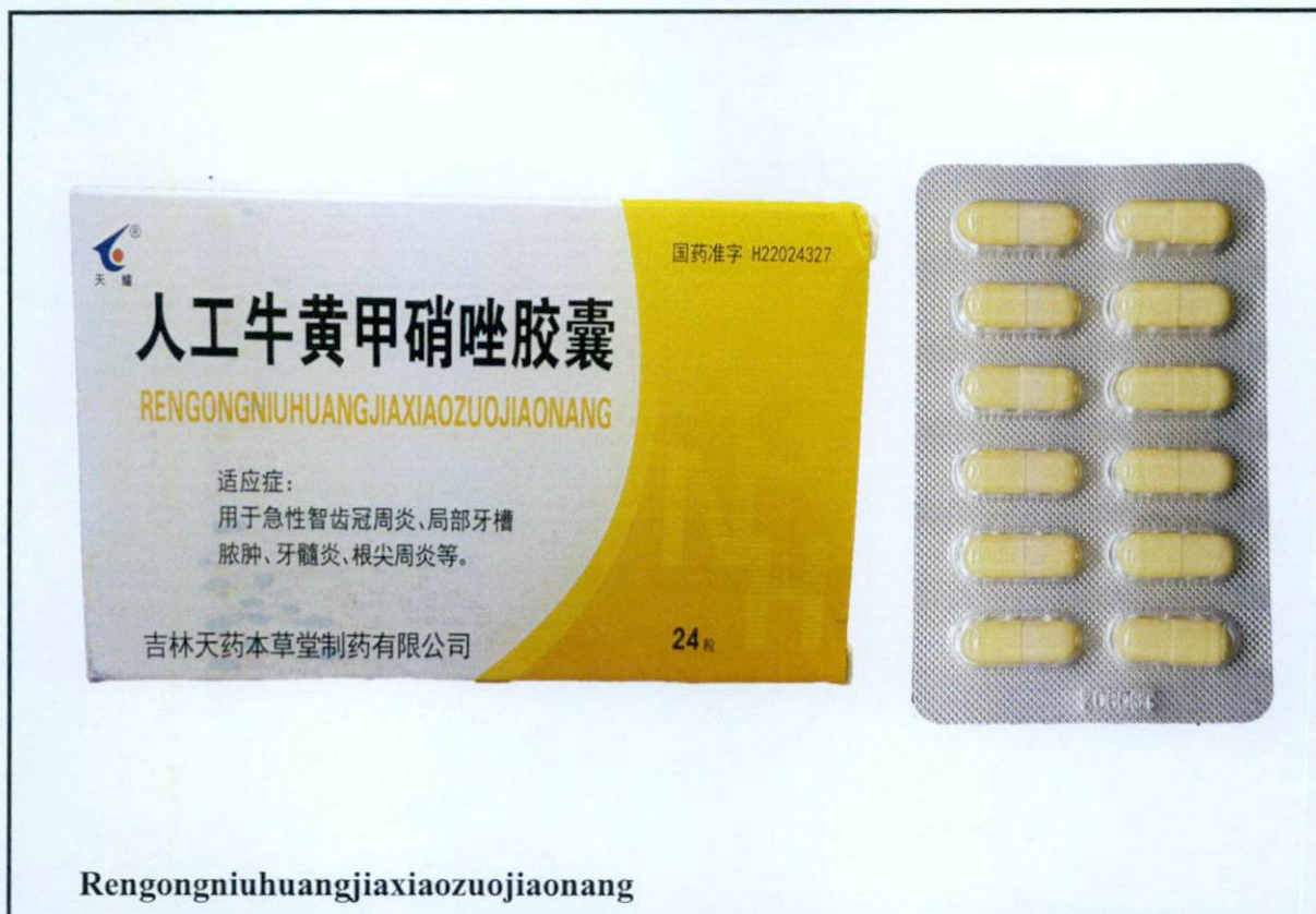
Rengongniu Huangjiaoxiaozuo Jiaonang