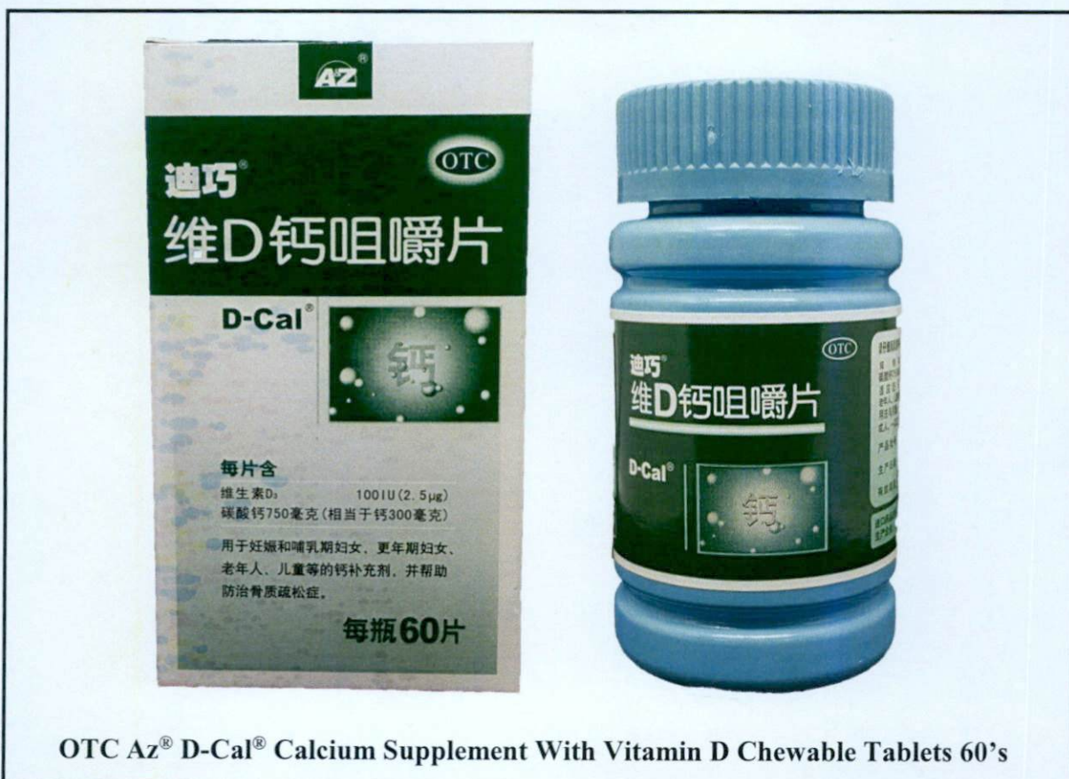
OTC Az ® D-Cal ® Calcium Supplement With Vitamin D Chewable Tablets 60's