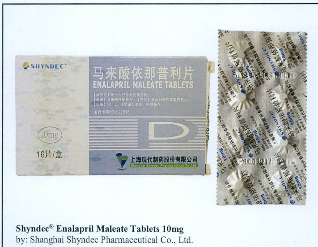
Shyndec® Enalapril Maleate Tablets 10mg by: Shanghai Shyndec Pharmaceutical Co., Ltd.

The Food and Drug Administration (FDA) advises the public against the purchase and use of the following unregistered drug products: