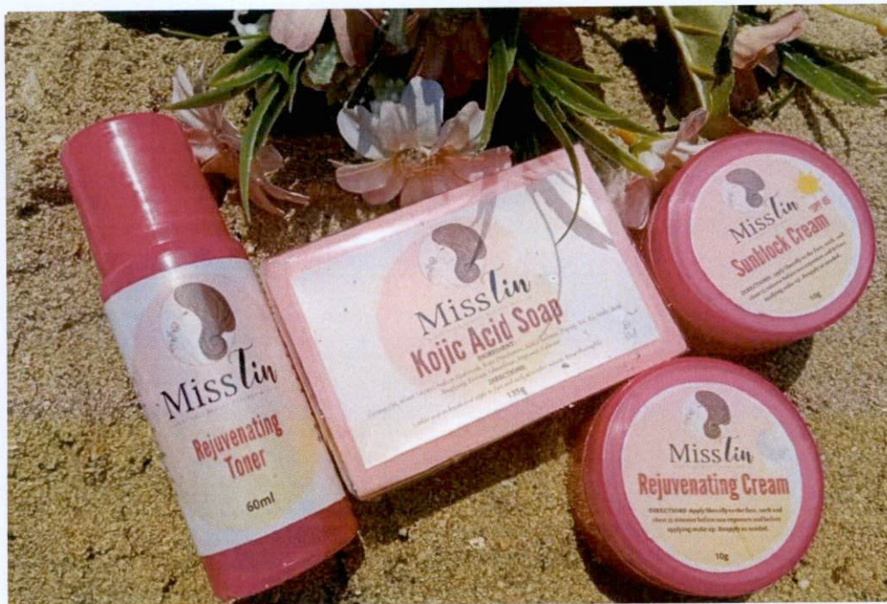
Figure 1. Unauthorized Product MISS TIN REJUVENATING SET

The Food and Drug Administration (FDA) warns the public from purchasing and using the following unauthorized cosmetic products. (Refer to the image below)