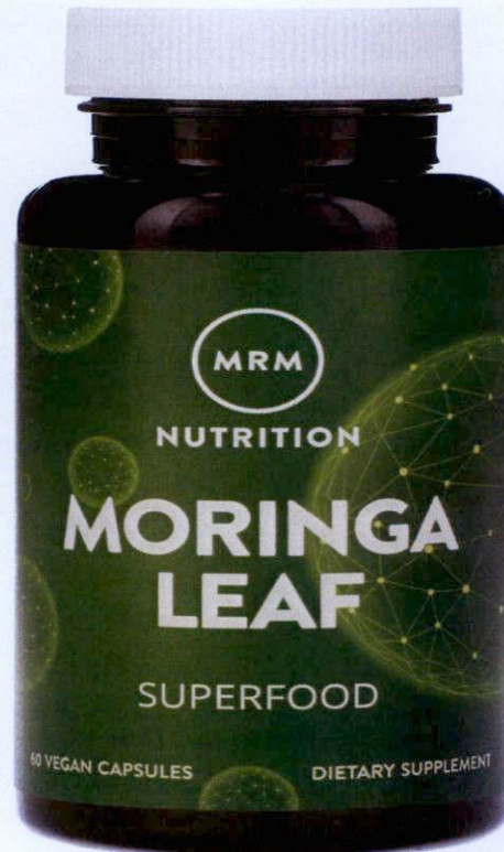
Figure 5. Unregistered MRM NUTRITION Moringa Leaf Superfood Dietary Supplement, 60 Vegan Capsules