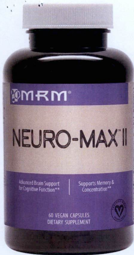
Figure 2. Unregistered MRM Neuro-Max II Dietary Supplement, 60 Vegan Capsule