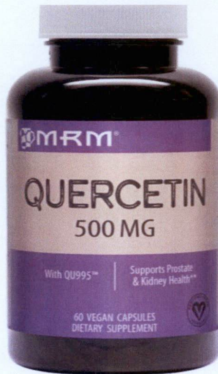
Figure 1. Unregistered QUERCETIN 500mg Dietary Supplement, 60 Vegan Capsule

The Food and Drug Administration (FDA) warns all healthcare professionals and the general public NOT TO PURCHASE AND CONSUME the following unregistered food supplements: