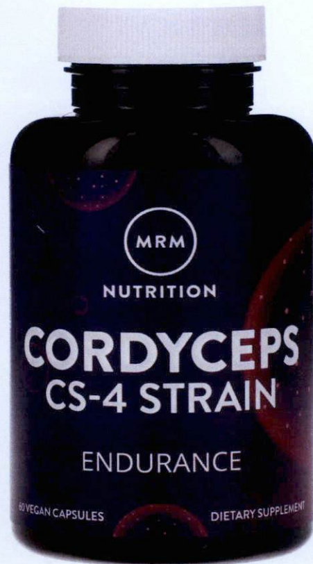
Figure 3. Unregistered MRM NUTRITION Cordyceps CS-4 Strain – Endurance Dietary Supplement, 60 Vegan Capsules