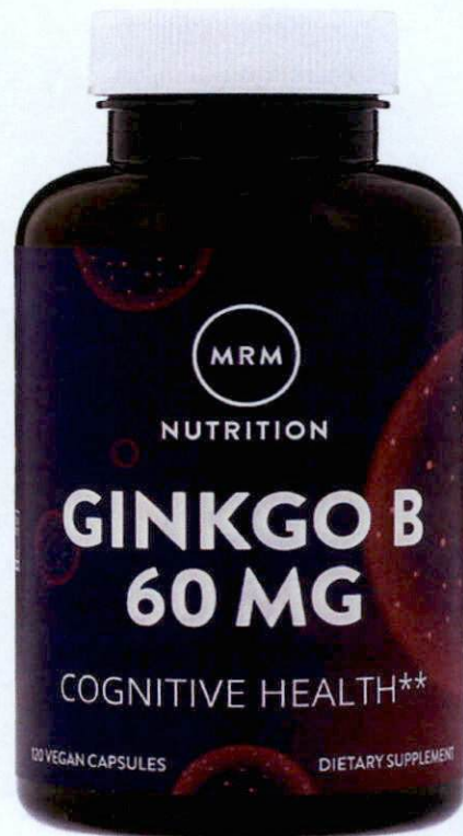
Figure 5. Unregistered MRM NUTRITION Ginkgo B 60mg – Cognitive Health Dietary Supplement, 120 Vegan Capsules