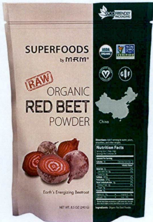
Figure 4. Unregistered SUPERFOODS BY MRM Raw Organic Red Beet Powder – Earth's Energizing Beetroot, Net Wt. 8.5oz (240g)