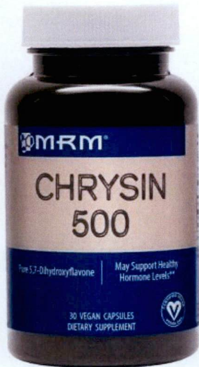
Figure 2. Unregistered MRM Chrysin 500 Dietary Supplement, 30 Vegan Capsules