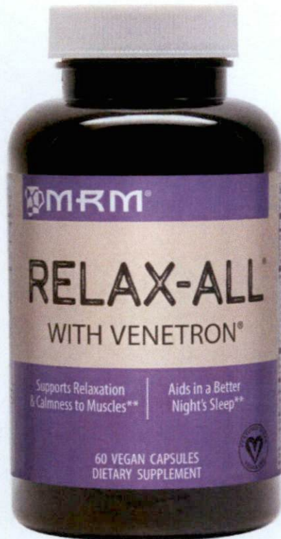
Figure 3. Unregistered MRM Relax-All with Venetron Dietary Supplement, 60 Vegan Capsules