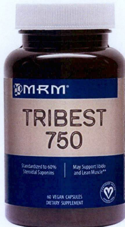
Figure 1. Unregistered MRM Tribest 750 Dietary Supplement, 60Vegan Capsules

The Food and Drug Administration (FDA) warns all healthcare professionals and the general public NOT TO PURCHASE AND CONSUME the following unregistered food supplements: