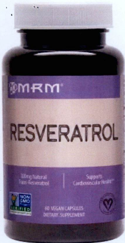
Figure 2. Unregistered MRM Resveratrol Dietary Supplement, 60 Vegan Capsules