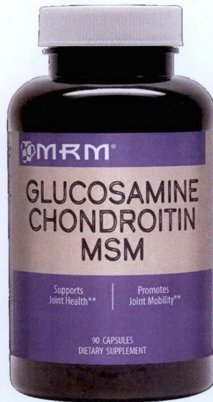
Figure 3. Unregistered MRM Glucosamine Chondroitin MSM Dietary Supplement, 90 Capsules