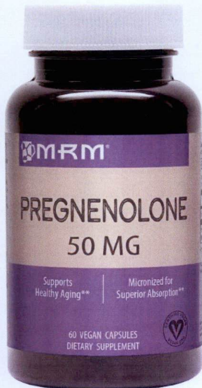
Figure 4. Unregistered MRM Pregnenolone 50mg Dietary Supplement, 60 Vegan Capsules