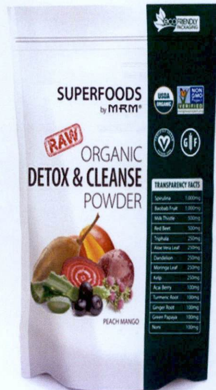
Figure 5. Unregistered SUPERFOODS BY MRM Raw Organic Detox & Cleanse Powder – Peach Mango, Net Wt. 120g