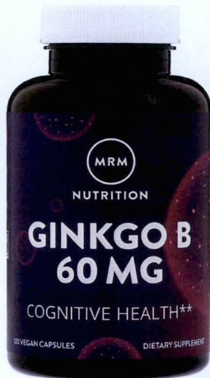
Figure 5. Unregistered MRM NUTRITION Ginkgo B 60mg – Cognitive Health Dietary Supplement, 120 Vegan Capsules