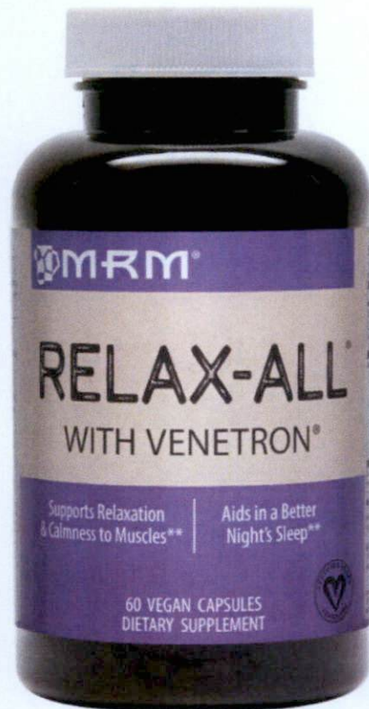
Figure 3. Unregistered MRM Relax-All with Venetron Dietary Supplement, 60 Vegan Capsules