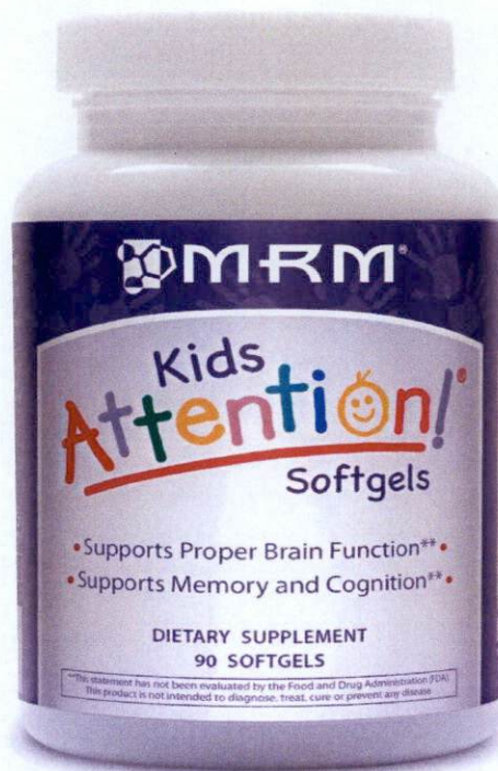
Figure 1. Unregistered MRM Kids Attention! Softgels Dietary Supplement, 90 Softgels

The Food and Drug Administration (FDA) warns all healthcare professionals and the general public NOT TO PURCHASE AND CONSUME the following unregistered food supplements: