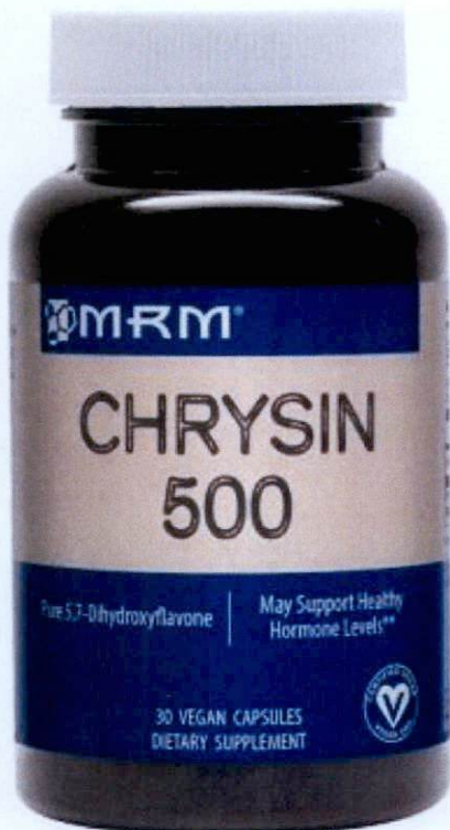
Figure 2. Unregistered MRM Chrysin 500 Dietary Supplement, 30 Vegan Capsules