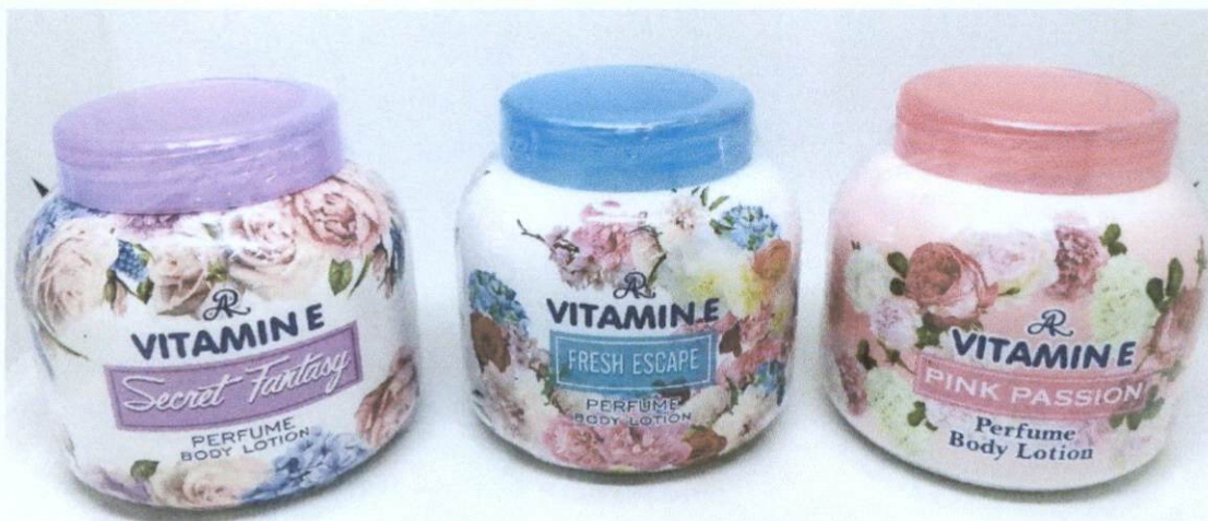
Figure 2. Unauthorized Product AR VITAMIN E COLLAGEN PEPTIDE BODY CREAM