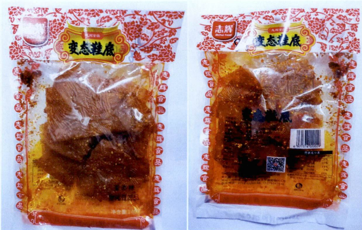
Figure 3. Unregistered ZHIZHUI Rectangular Food Product in White Vacuum Sealed Packaging with Red Design (In Foreign Language)