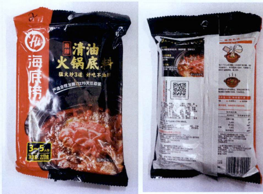
Figure 1. Unregistered HI Food Sauce Spicy Hot Pot in Black and Red Packaging (In Foreign Language)

The Food and Drug Administration (FDA) warns all healthcare professionals and the general public NOT TO PURCHASE AND CONSUME the following unregistered food products: