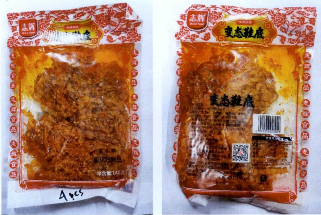
Figure 4. Unregistered ZHIZHUI Strips Food Product in White Vacuum Sealed Packaging with Red Design (In Foreign Language)