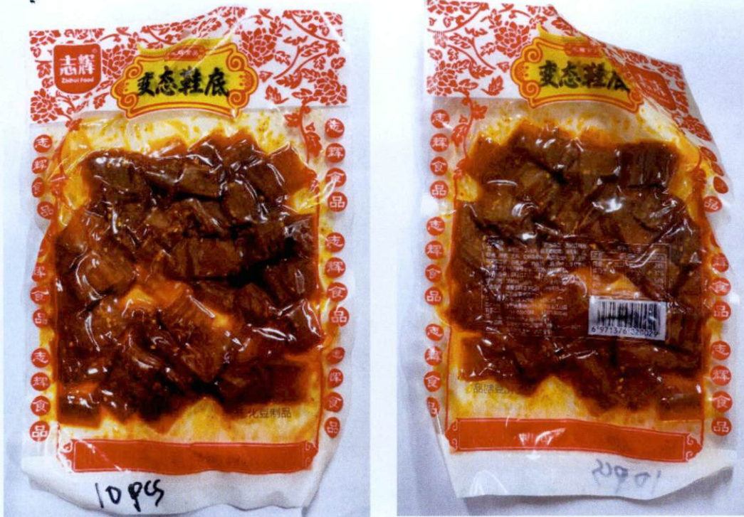
Figure 2. Unregistered ZHIZHUI Food Product in White Vacuum Sealed Packaging with Red Design (In Foreign Language)