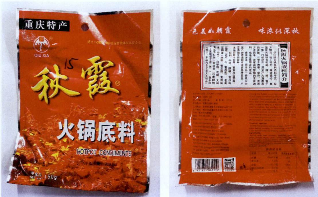
Figure 5. Unregistered QIU XIA Hotpot Condiments (In Foreign Language)