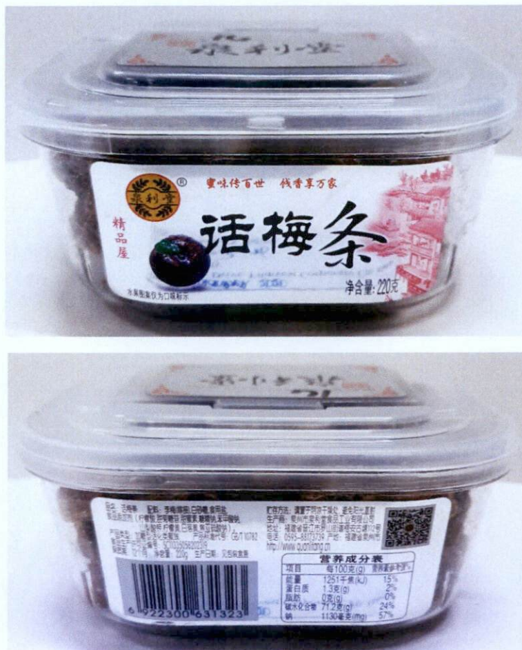
Figure 5. Unregistered Dried Fruit in Plastic Tupperware with Transparent Lid (In Foreign Language)