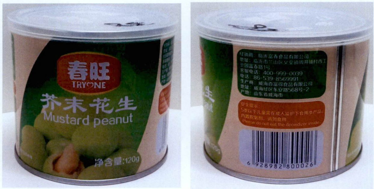
Figure 3. Unregistered TRYONE Mustard Peanut in Tin Can with Green and Off White Label (In Foreign Language)