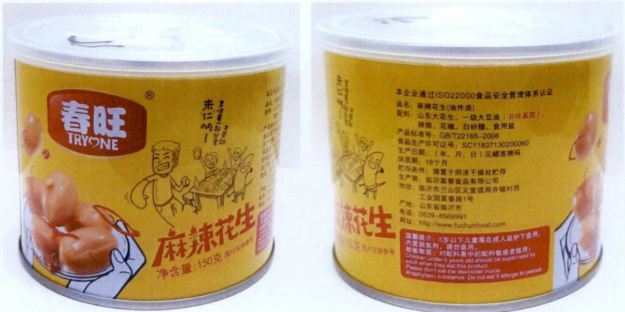
Figure 2. Unregistered TRYONE Peanuts in Tin Can with Yellow Label (In Foreign Language)