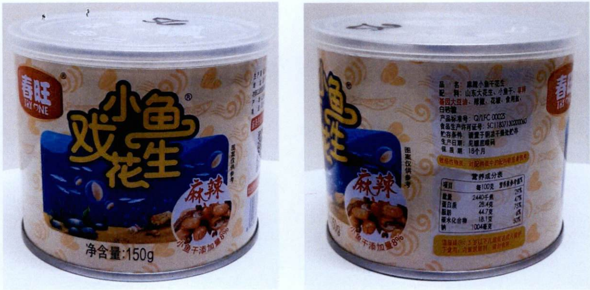
Figure 4. Unregistered TRYONE Peanuts in Off White Tin Can with Seafood Image on the label (In Foreign Language)