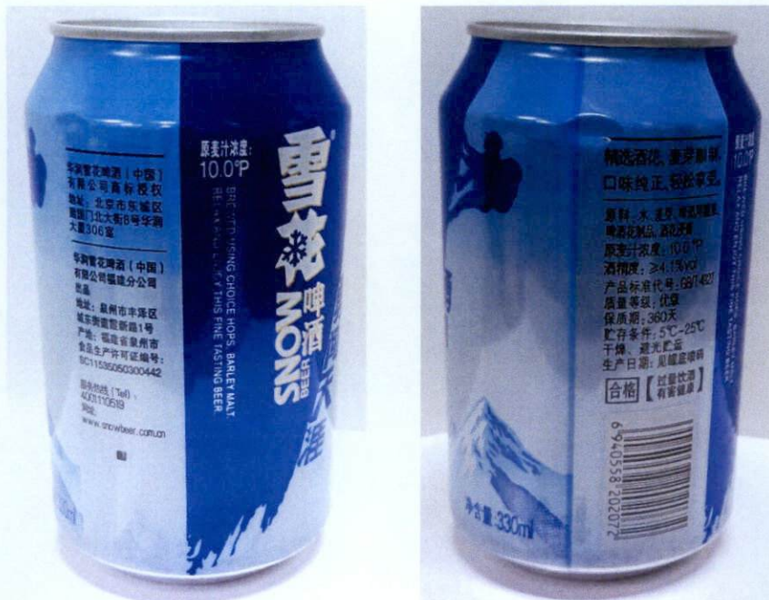
Figure 1. Unregistered SNOW Beer in Blue Easy Open Can (In Foreign Language)

The Food and Drug Administration (FDA) warns all healthcare professionals and the general public NOT TO PURCHASE AND CONSUME the following unregistered food products: