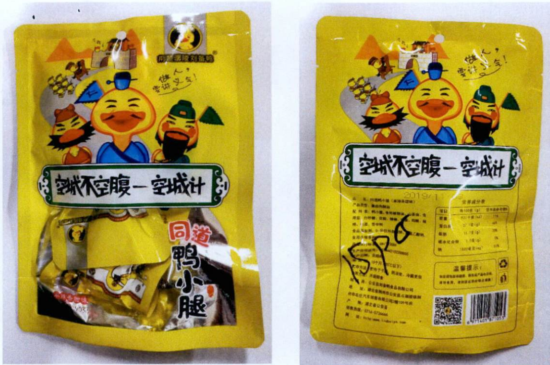
Figure 4. Unregistered Food Product with Green Label and Duck Cartoon in Yellow Packaging (In Foreign Language)