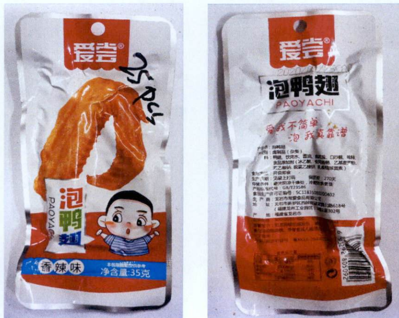
Figure 1. Unregistered PAOYACHI Preserved Chicken Wings with Boy Image in Pink Vacuum Sealed Packaging (In Foreign Language)

The Food and Drug Administration (FDA) warns all healthcare professionals and the general public NOT TO PURCHASE AND CONSUME the following unregistered food products: