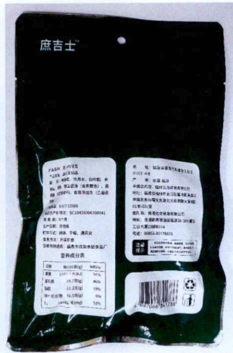
Figure 2. Unregistered Preserved Food Product in Dark Green and Black Packaging (In Foreign Language)