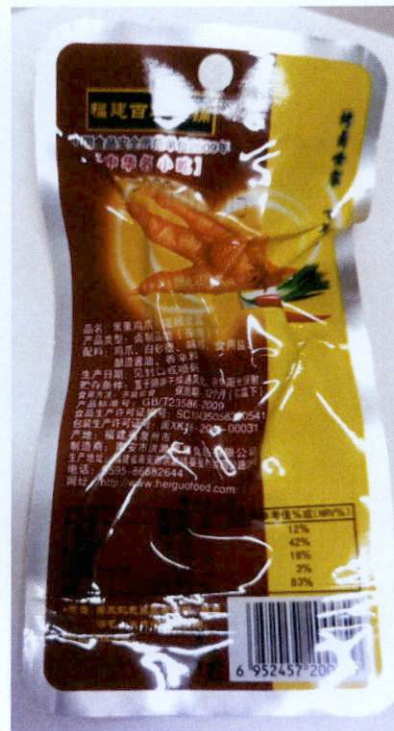
Figure 3. Unregistered HEIGUOSHIPIN Chicken Feet in Brown and Yellow Vacuum Sealed Packaging (In Foreign Language)