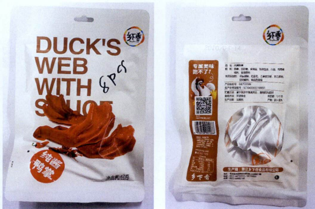
Figure 5. Unregistered Duck's Web with Sauce in White Packaging with Brown Color Design (In Foreign Language)