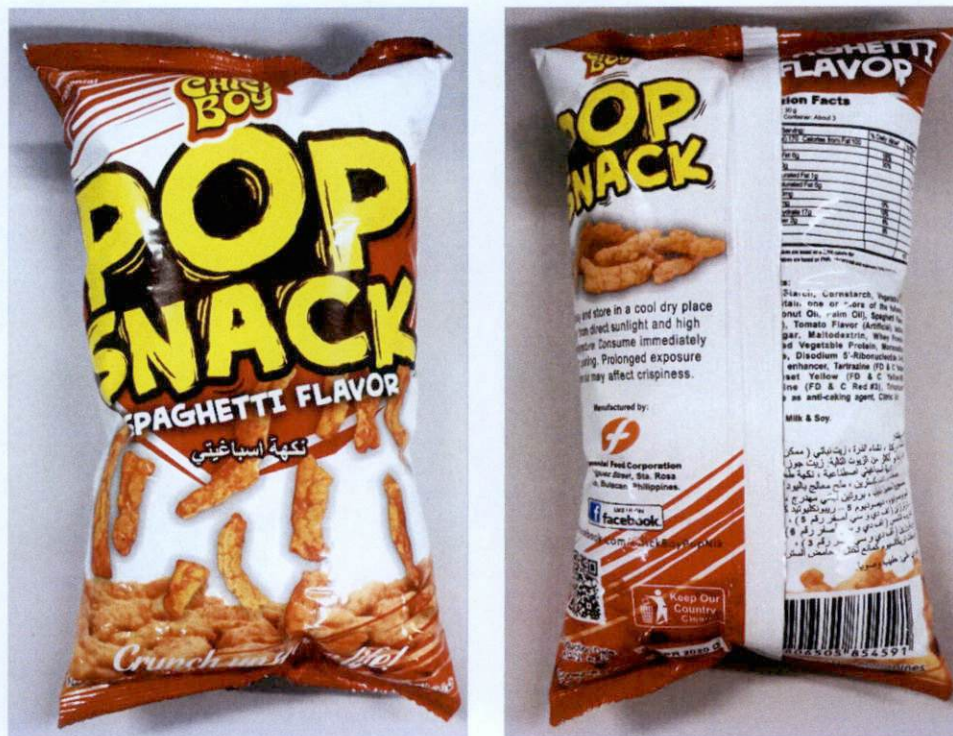
Figure 1. Unregistered CHICKBOY POPSNACK Spaghetti Flavor

The Food and Drug Administration (FDA) warns all healthcare professionals and the general public NOT TO PURCHASE AND CONSUME the following unregistered food products: