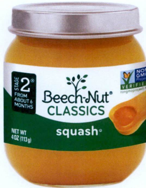
Figure 4. Unregistered BEECH-NUT CLASSICS STAGE 2 Squash