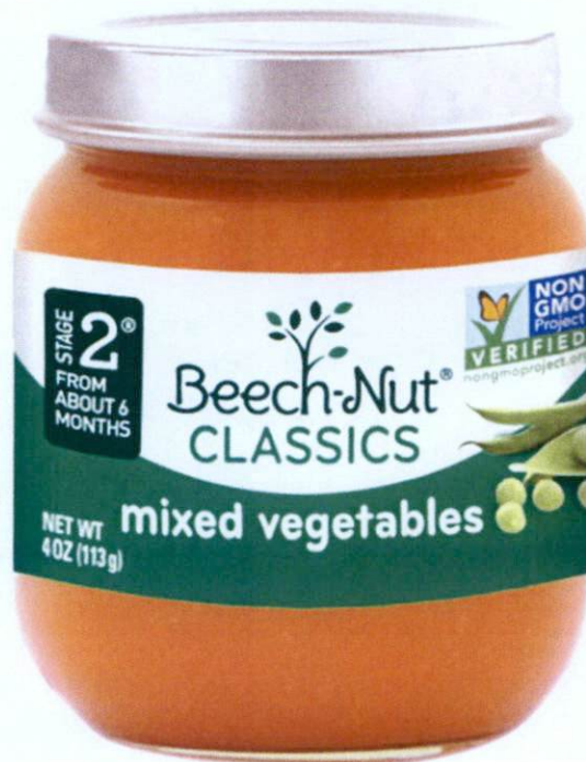
Figure 5. Unregistered BEECH-NUT CLASSICS STAGE 2 Mixed Vegetables