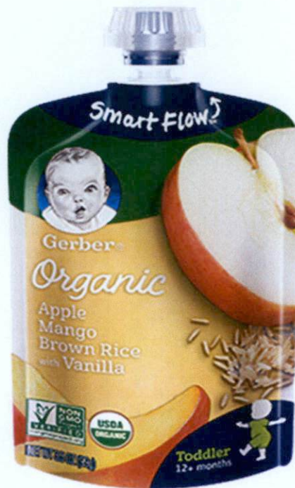
Figure 3. Unregistered GERBER ORGANIC TODDLER POUCHES Apple Mango Brown Rice with Vanilla