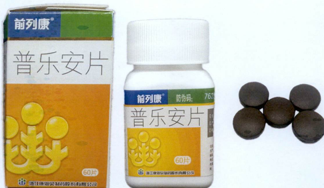
Pule' an Pian [as reflected in the package insert]