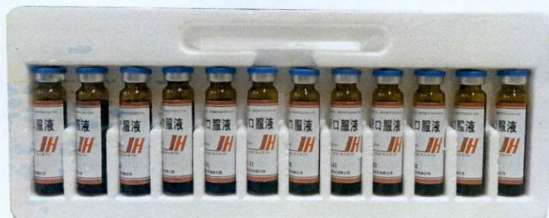
JINHUI Xianrong Zhuangyang Koufuye [as reflected in the package insert]