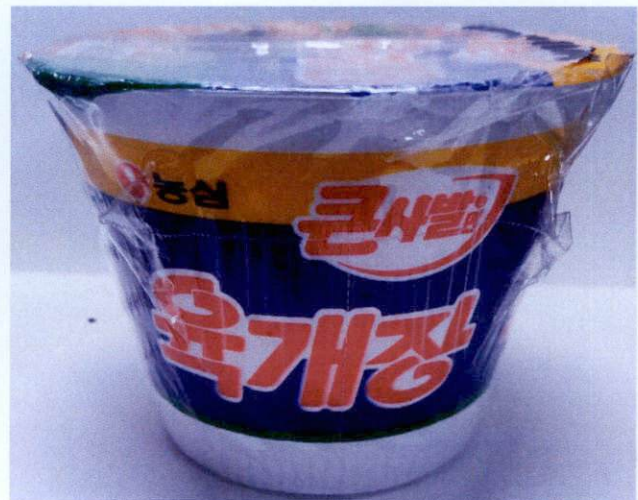
Figure 1. Unregistered Instant Cup Noodles with Orange, Green and Blue Design (In Foreign Language)