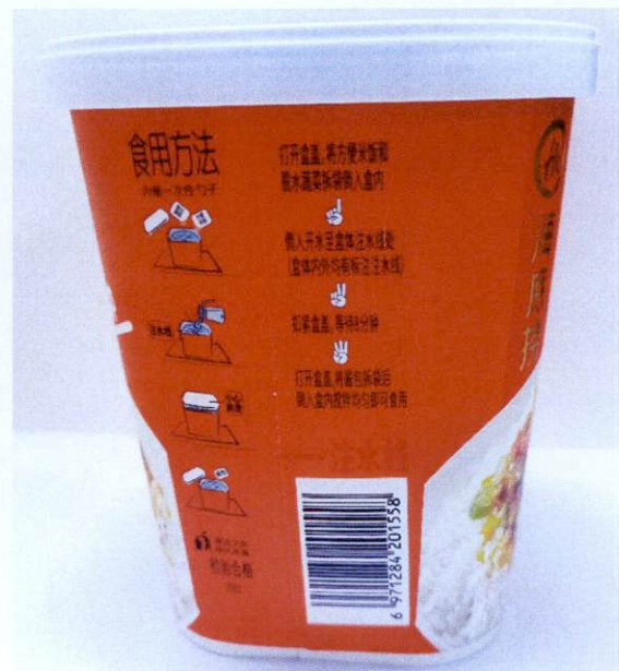
Figure 5. Unregistered HI Rice Meal in Orange and White Paper Cup (In Foreign Language)

The FDA verified through post-marketing surveillance that the abovementioned food products are not registered and no corresponding Certificates of Product Registration (CPR) have been issued. Pursuant to the Republic Act No. 9711, otherwise known as the “Food and Drug