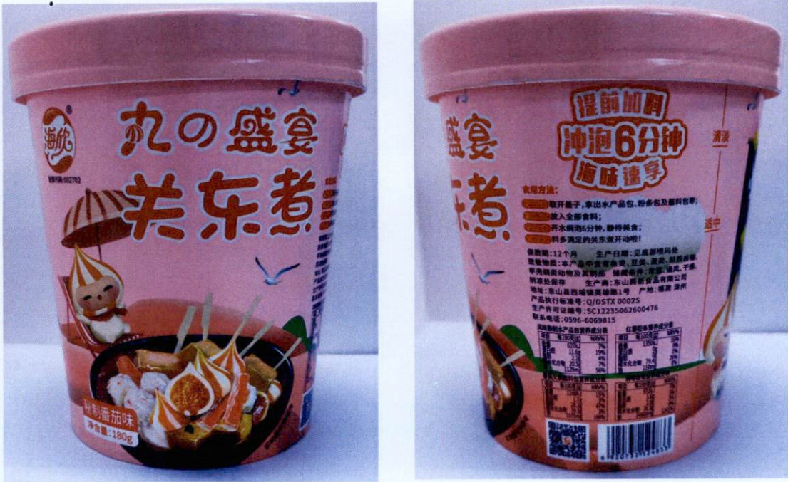
Figure 2. Unregistered Dumpling in Pink Paper Cup (In Foreign Language)