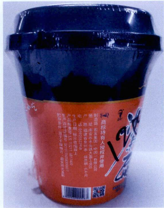
Figure 4. Unregistered Instant Seafood Noodles in Red and Black Paper Cup (In Foreign Language)