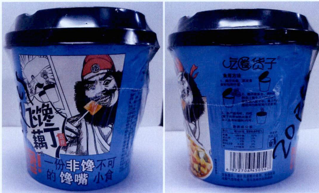
Figure 3. Unregistered SHEDANGJIA CHIHUQUANZI Food in Blue Paper Cup with Cartoon Image (In Foreign Language)