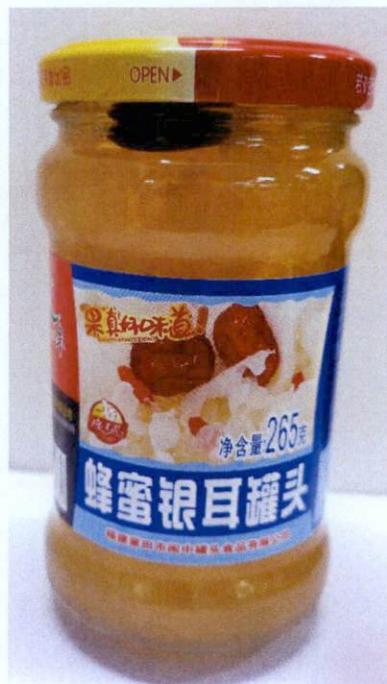
Figure 1. Unregistered GUOZHENHAOWEIDAO Preserved Fruit in Glass Jar (In Foreign Language)

The Food and Drug Administration (FDA) warns all healthcare professionals and the general public NOT TO PURCHASE AND CONSUME the following unregistered food products: