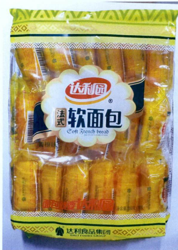
Figure 5. Unregistered DALIYUAN CLASSIC FOODS Soft French Bread (In Foreign Language)