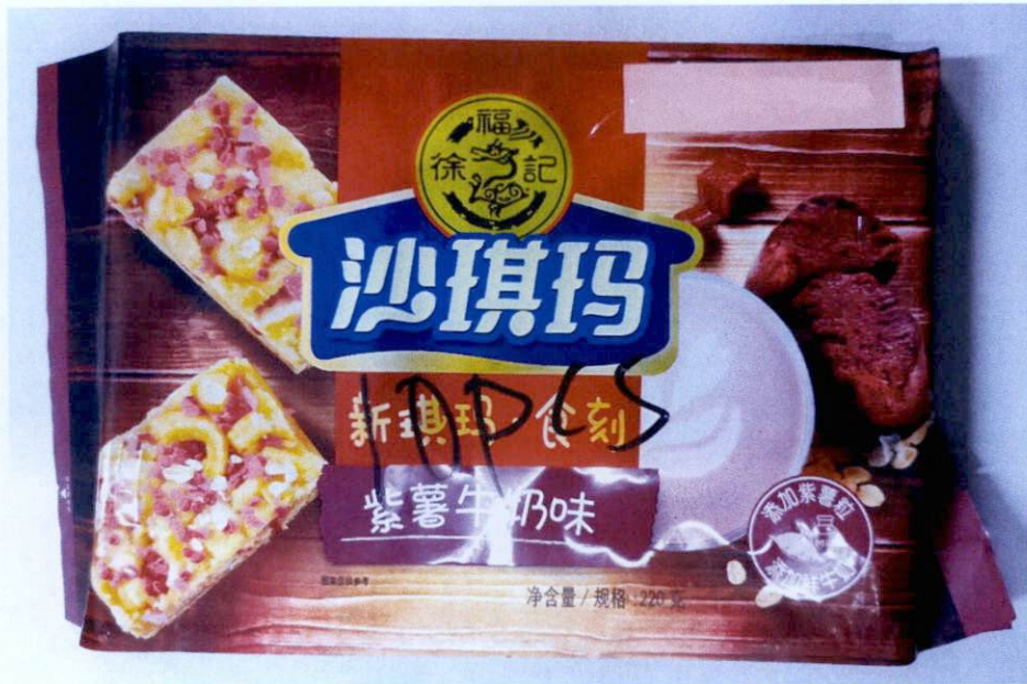
Figure 4. Unregistered Food bar in Purple Plastic Packaging (In Foreign Language)