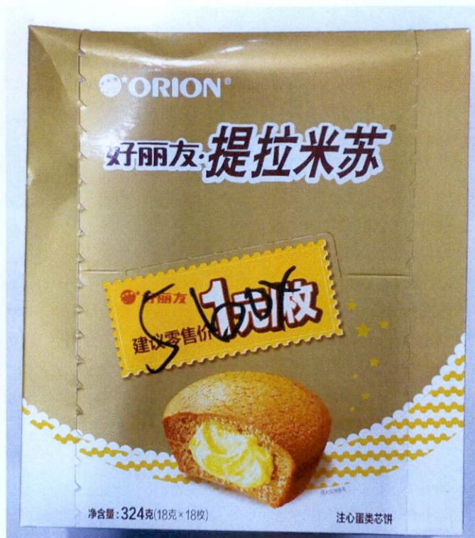
Figure 2. Unregistered ORION Tiramisu Cupcake in Gold colored Box (In Foreign Language)