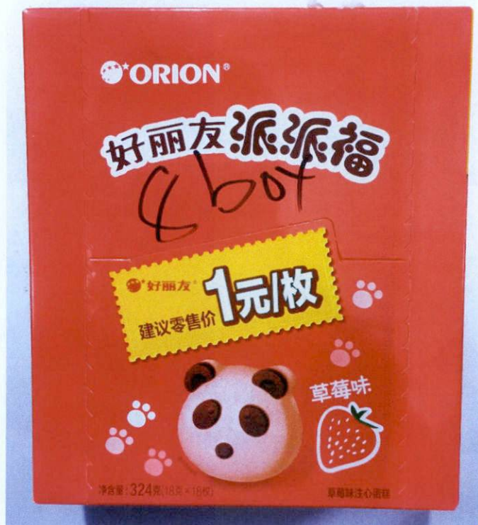
Figure 3. Unregistered ORION Panda like Cupcake with Strawberry Image in Pink Colored Box (In Foreign Language)