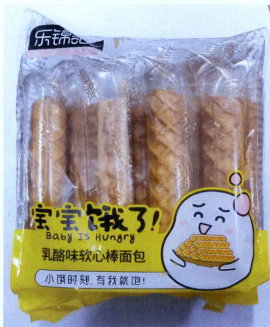
Figure 1. Unregistered Preserved Waffle in Clear Packaging with Yellow Lining (In Foreign Language)

The Food and Drug Administration (FDA) warns all healthcare professionals and the general public NOT TO PURCHASE AND CONSUME the following unregistered food products: