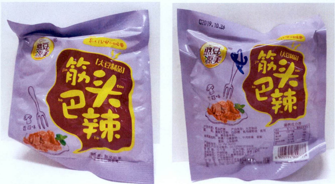
Figure 3. Unregistered JIM TOU BA LA Preserved Food in Light Violet Packaging (In Foreign Language)