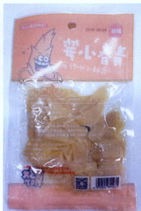
Figure 5. Unregistered CLASSIC SNACKS Preserved Food 3x Spicy in Clear Vacuum Sealed Packaging with Orange Linings (In Foreign Language)