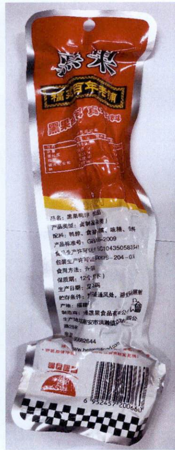
Figure 4. Unregistered HEIGUOSHIPIN Preserved Chicken Wing in Red and White Vacuum Sealed Packaging (In Foreign Language)