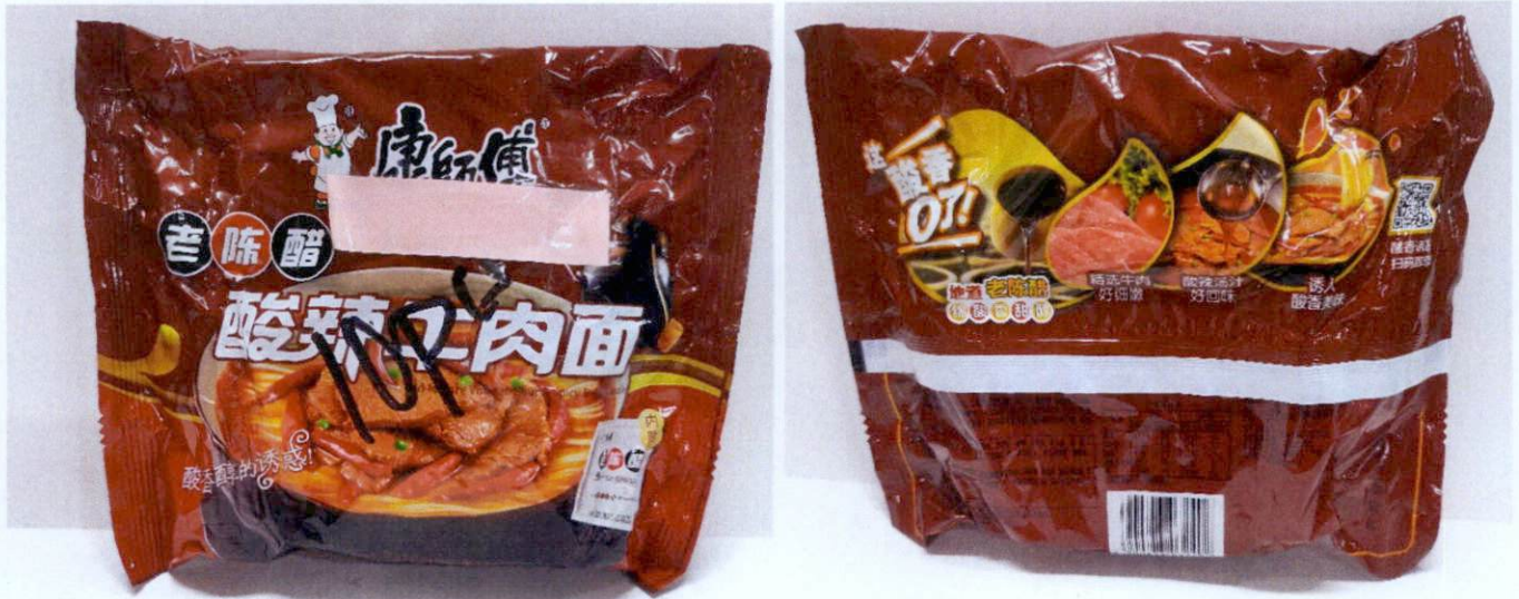
Figure 2. Unregistered Instant Noodles with Mild Mixture Vinegar Sour & Spicy Beef Noodle in Maroon Packaging (In Foreign Language)