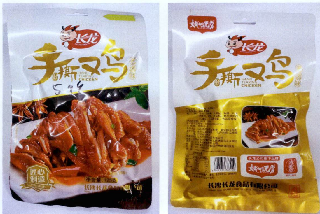
Figure 5. Unregistered CHANGLONG FOOD Hand Tearing Chicken in Gold and White Packaging (In Foreign Language)