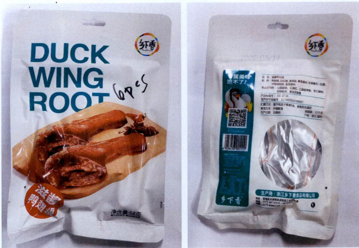
Figure 4. Unregistered Duck Wing Root with Green Blue Design in White Packaging (In Foreign Language)