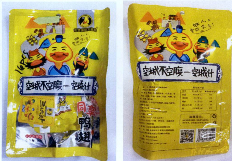
Figure 1. Unregistered Food Product in Yellow Packaging (In Foreign Language)

The Food and Drug Administration (FDA) warns all healthcare professionals and the general public NOT TO PURCHASE AND CONSUME the following unregistered food products: