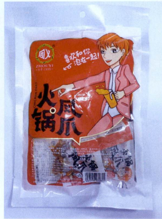
Figure 3. Unregistered ZHOUYI Chicken Feet with Male Anime in White and Red Packaging (In Foreign Language)