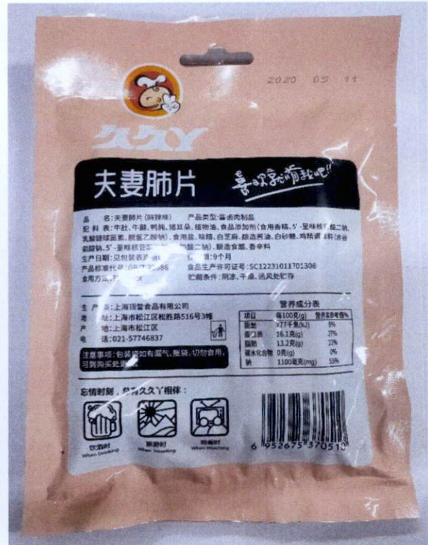
Figure 2. Unregistered FUQIFEIPIAN Preserved Meat in Peach Packaging (In Foreign Language)