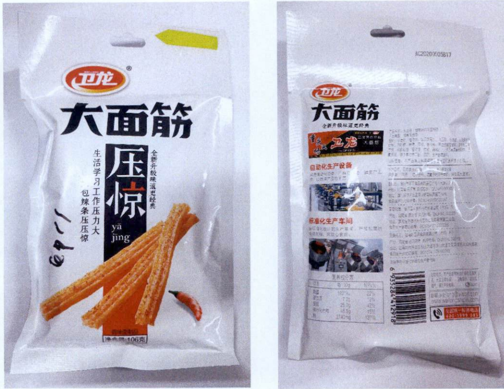
Figure 4. Unregistered WEI-LONG YA JING Dried Tofu Strips in White Packaging (In Foreign Language)

The FDA verified through post-marketing surveillance that the abovementioned food products are not registered and no corresponding Certificates of Product Registration (CPR) have been issued. Pursuant to the Republic Act No. 9711, otherwise known as the “Food and Drug Administration Act of 2009”, the manufacture, importation, exportation, sale, offering for sale, distribution, transfer, non-consumer use, promotion, advertising or sponsorship of health products without the proper authorization is prohibited.