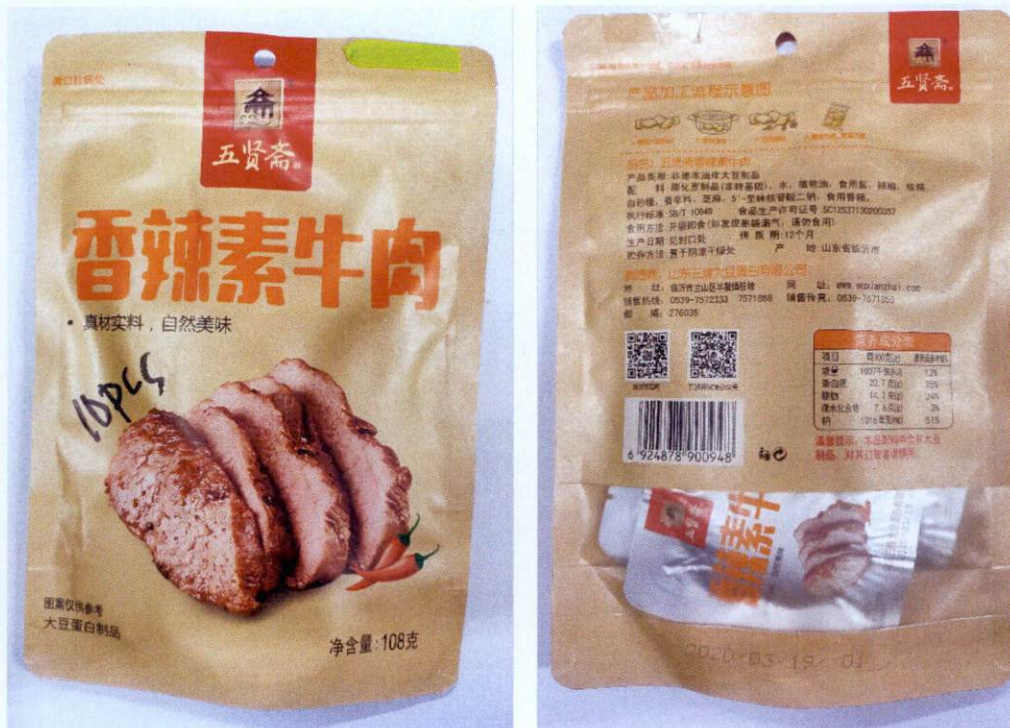
Figure 1. Unregistered Meat Product individually packed in Silver Vacuum Sealed Packaging in Brown Resealable Pack (In Foreign Language)

The Food and Drug Administration (FDA) warns all healthcare professionals and the general public NOT TO PURCHASE AND CONSUME the following unregistered food products: