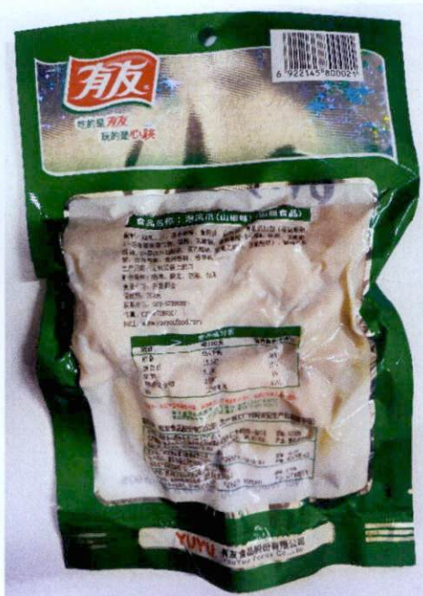
Figure 3. Unregistered YUYU Preserved Chicken Feet in Green Vacuum Sealed Packaging (In Foreign Language)