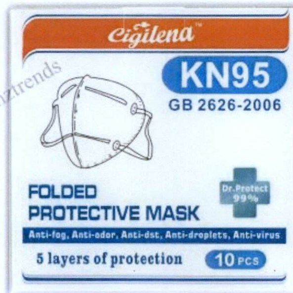
Figure 1. Unnotified Cigilena KN95 Folded Protective mask

The Food and Drug Administration (FDA) warns all healthcare professionals and the general public NOT TO PURCHASE AND USE the unnotified medical device products: