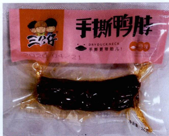
Figure 3. Unregistered Dry Duck Neck Meat Product in Transparent Pink Colored Vacuumed Pouch