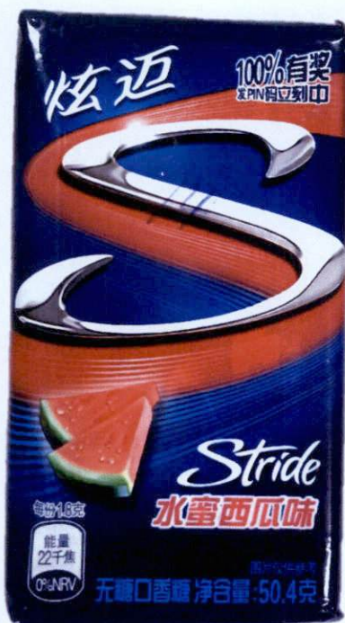
Figure 4. Unregistered STRIDE Candy Watermelon Flavor with Blue, Red and Silver Packaging