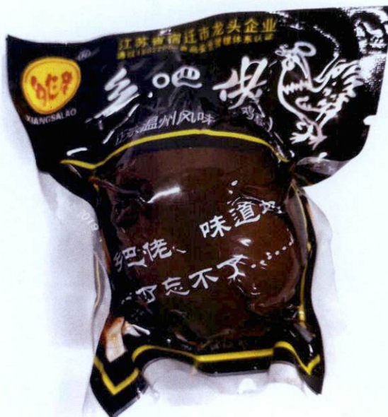
Figure 1. Unregistered XIANGSALAO Chicken Egg in a Vacuumed Pouch with Black Packaging

The Food and Drug Administration (FDA) warns all healthcare professionals and the general public NOT TO PURCHASE AND CONSUME the following unregistered food products: