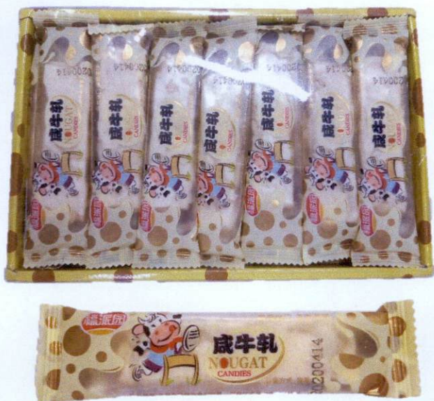
Figure 2. Unregistered NOUGAT Candy Bars in Yellow Transparent Packaging Inside a Box