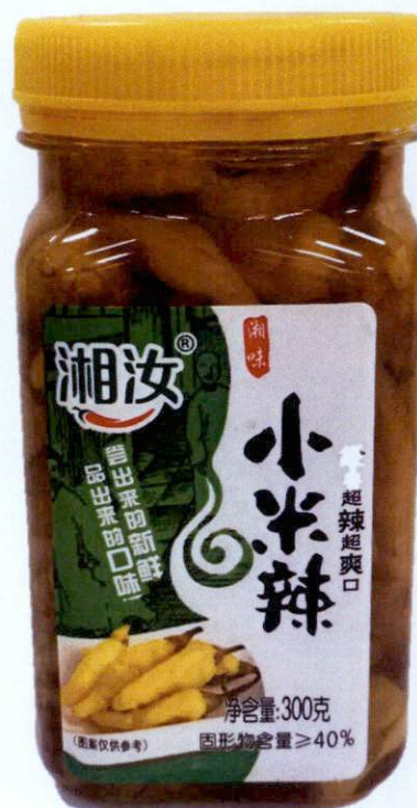
Figure 5. Unregistered Fermented Chili in a Plastic Bottle with Yellow Cap