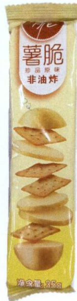
Figure 1. Unregistered Crackers in Yellow Packaging (In Foreign Language)

The Food and Drug Administration (FDA) warns all healthcare professionals and the general public NOT TO PURCHASE AND CONSUME the following unregistered food products: