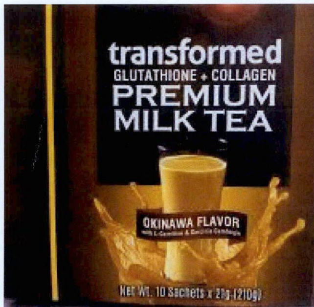
Figure 4. Unregistered TRANSFORMED Glutathione + Collagen Premium Milk Tea Okinawa Flavor