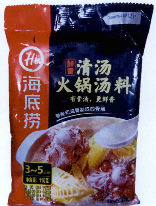
Figure 5. Unregistered HI Food Product in Black Packaging with Red Label with Image of Bone Broth (In Foreign Language)