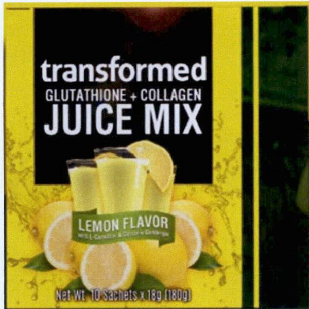
Figure 2. Unregistered TRANSFORMED Glutathione + Collagen Juice Mix Lemon Flavor