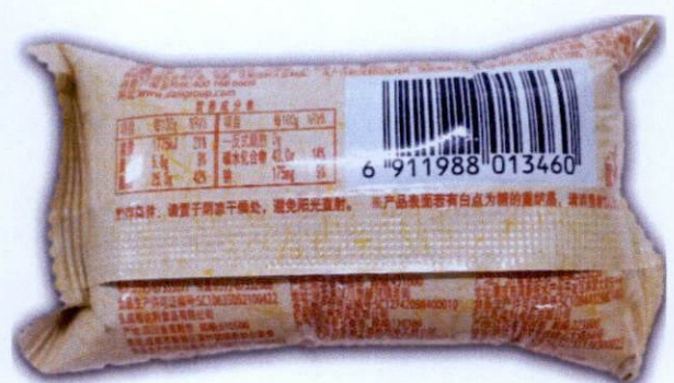
Figure 3. Unregistered DALIYUAN Swiss Roll Orange Flavor (In Foreign Language)