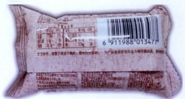
Figure 5. Unregistered DALIYUAN Swiss Roll Chocolate Flavor (In Foreign Language)