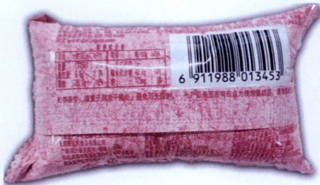
Figure 2. Unregistered DALIYUAN Swiss Roll Strawberry Flavor (In Foreign Language)