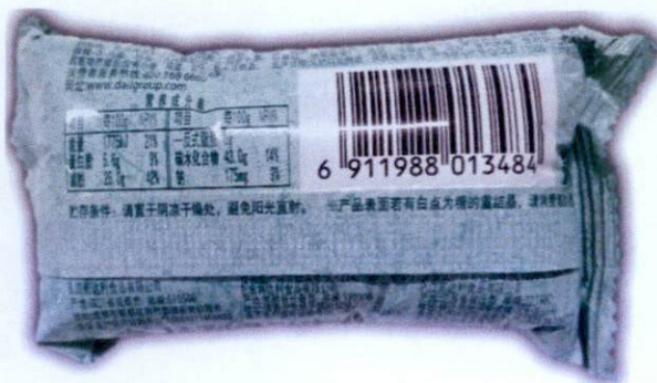
Figure 4. Unregistered DALIYUAN Swiss Roll Banana Flavor (In Foreign Language)