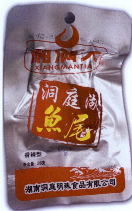
Figure 1. Unregistered XIANGMANTIA In Vacuumed Silver Foil Pack with Red Colored Label (In Foreign Language)

The Food and Drug Administration (FDA) warns all healthcare professionals and the general public NOT TO PURCHASE AND CONSUME the following unregistered food products: