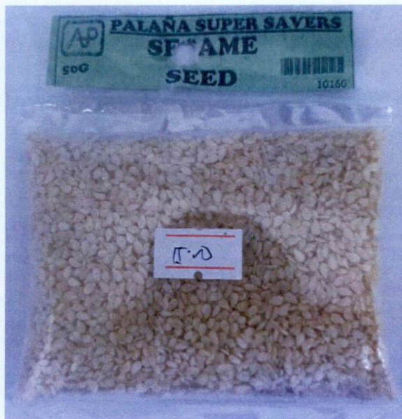
Figure 4. Unregistered PALAÑA Super Savers Sesame Seeds