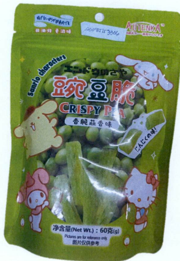
Figure 1. Unregistered AJITENKA Crispy Pea (In Foreign Language)

The Food and Drug Administration (FDA) warns all healthcare professionals and the general public NOT TO PURCHASE AND CONSUME the following unregistered food products: