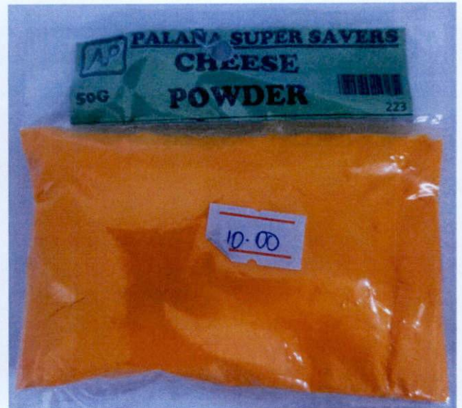
Figure 3. Unregistered PALAÑA Super Savers Sprinkles Cheese Powder