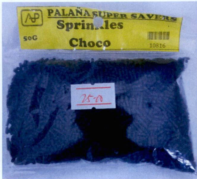
Figure 2. Unregistered PALAÑA Super Savers Sprinkles Choco Flavor