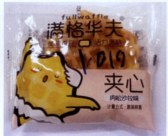
Figure 5. Unregistered Full Waffle in Transparent Pouch with Yellow Markings (In Foreign Language)