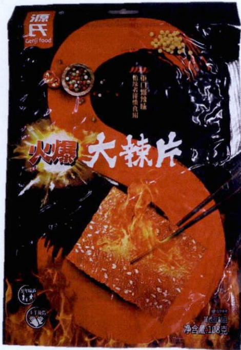
Figure 2. Unregistered GENJI FOOD Meat Like Product in Vacuumed Pouch with Black and Red Label (In Foreign Language)