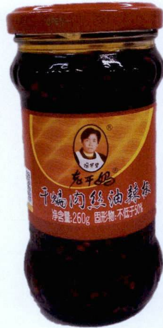
Figure 3. Unregistered Bottled Chili Paste with Red Lid and Image of Man (In Foreign Language)