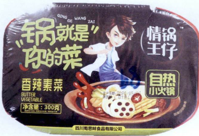
Figure 4. Unregistered QING GE WANGZAI Red Tub with Black and Green Colored Packaging with Image of Boy (In Foreign Language)