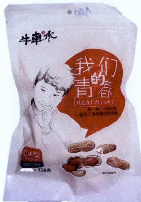
Figure 1. Unregistered White with Red Colored Pouch with Image of Man and Peanuts (In Foreign Language)

The Food and Drug Administration (FDA) warns all healthcare professionals and the general public NOT TO PURCHASE AND CONSUME the following unregistered food products: