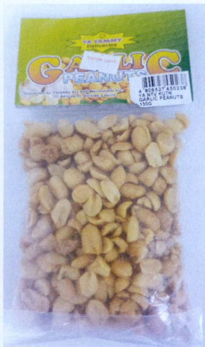
Figure 4. Unregistered YA YAMMY Garlic Peanuts