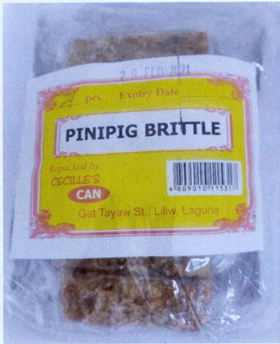
Figure 2. Unregistered Pinipig Brittle