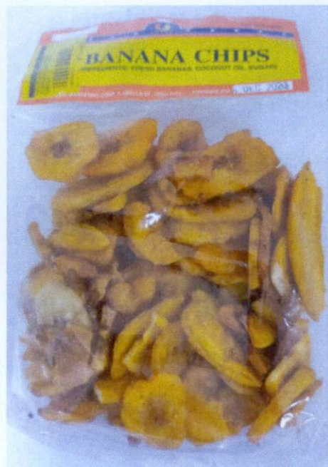
Figure 5. Unregistered TJ BRAND Banana Chips