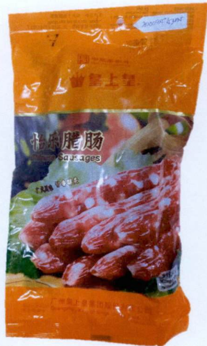
Figure 3. Unregistered Chinese Sausage in Orange Plastic Packaging (In Foreign Language)