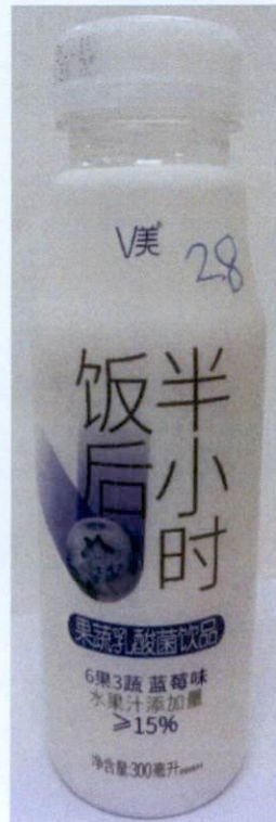
Figure 1. Unregistered Beverage in Clear Plastic Bottle with White Label with Image of Blueberry (In Foreign Language)

The Food and Drug Administration (FDA) warns all healthcare professionals and the general public NOT TO PURCHASE AND CONSUME the following unregistered food products: