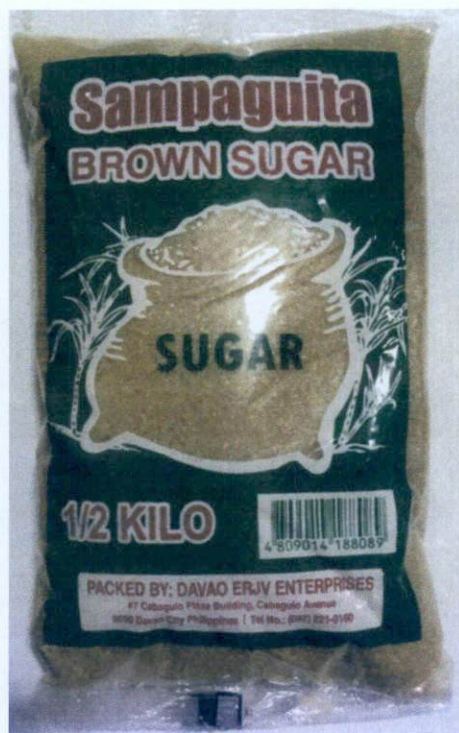
Figure 4. Unregistered SAMPAGUITA Brown Sugar