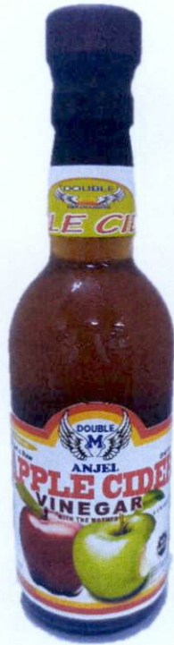
Figure 2. Unregistered DOUBLE MERCHANDISE ANJEL Unfiltered Apple Cider Vinegar