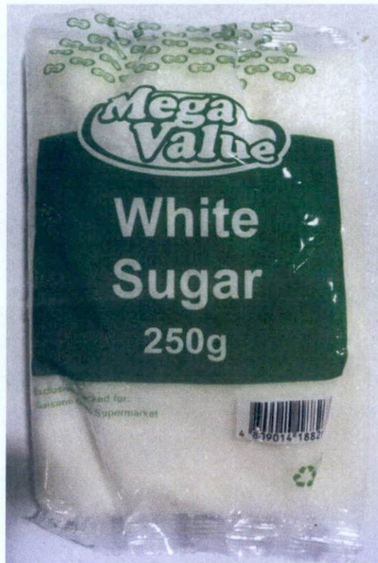
Figure 1. Unregistered MEGA VALUE White Sugar

The Food and Drug Administration (FDA) warns all healthcare professionals and the general public NOT TO PURCHASE AND CONSUME the following unregistered food products: