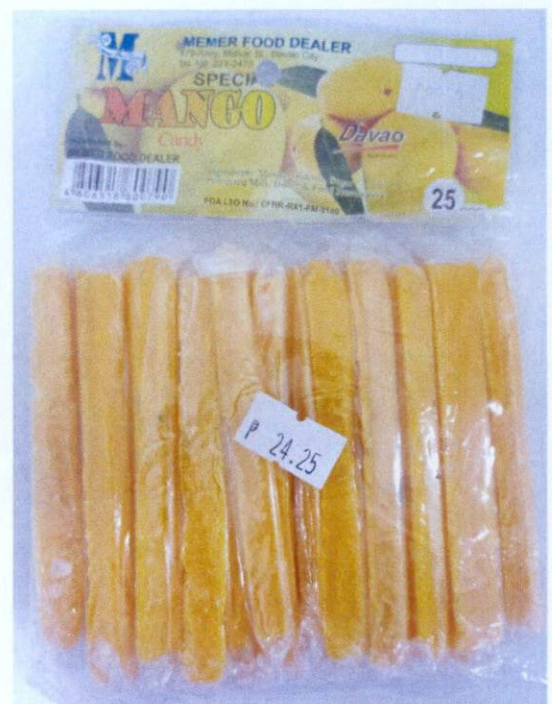
Figure 5. Unregistered MEMER FOOD DEALER Special Mango Candy