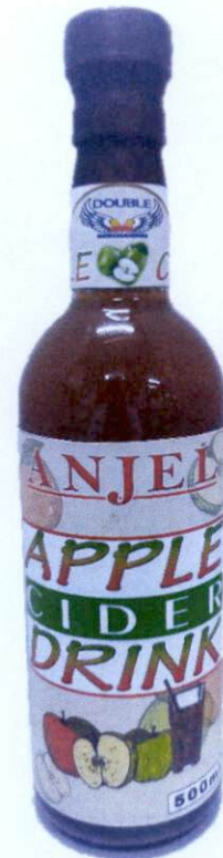
Figure 3. Unregistered DOUBLE MERCHANDISE ANJEL Apple Cider Drink