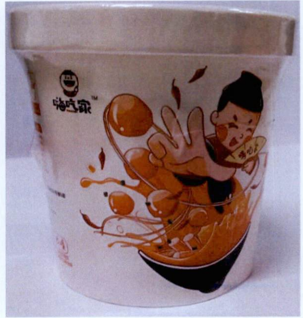
Figure 3. Unregistered CupNoodles in White Packaging (In Foreign Language)