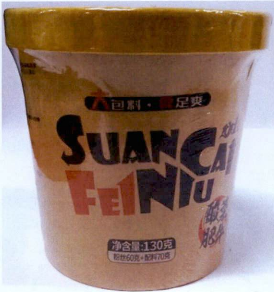
Figure 2. Unregistered SUANGCAI FEINIU Cup Noodles in Brown and Yellow Packaging (In Foreign Language)