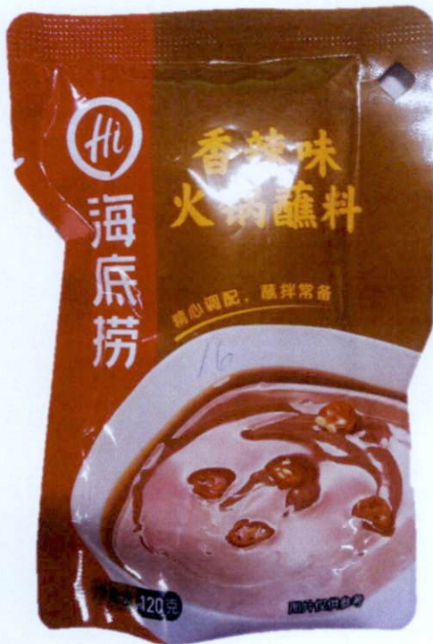
Figure 4. Unregistered HI Red and Brown Foil Pouch with Image of Red Soup with Chili (In Foreign Language)