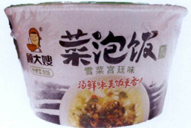
Figure 5. Unregistered Rice Porridge in Cup in White and Green Packaging (In Foreign Language)