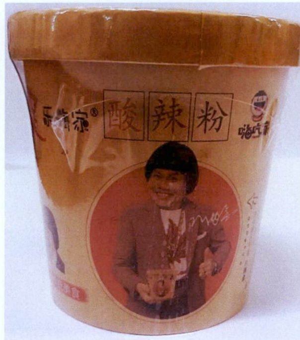
Figure 1. Unregistered Cup Noodles in Brown Packaging (In Foreign Language)

The Food and Drug Administration (FDA) warns all healthcare professionals and the general public NOT TO PURCHASE AND CONSUME the following unregistered food products: