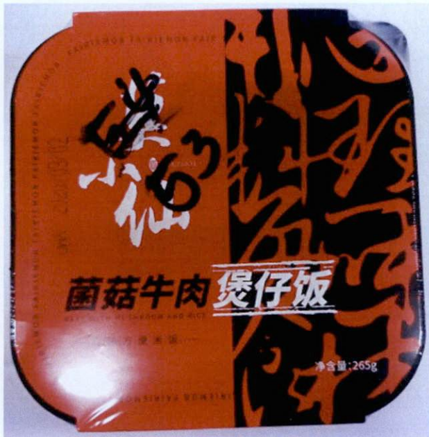
Figure 4. Unregistered FAIRIEMOR Beef with Mushroom and Rice (In Foreign Language)