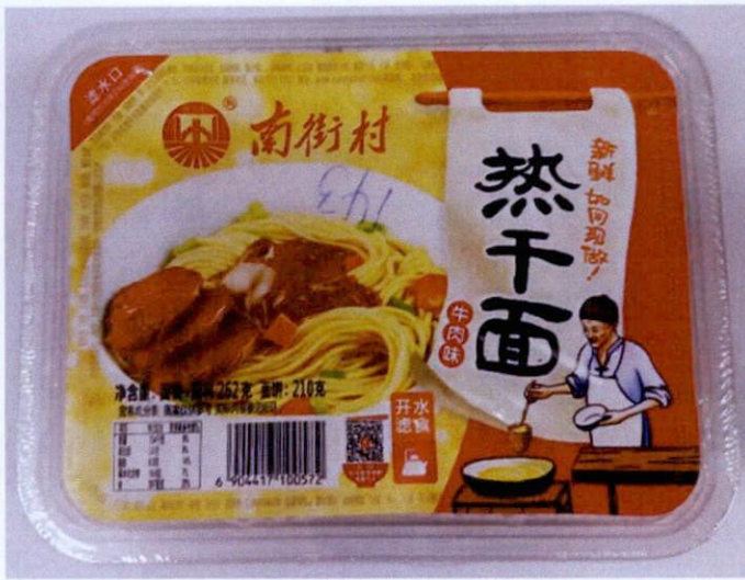
Figure 2. Unregistered Noodles with Yellow and Red Label in Rectangular Clear Plastic Container (In Foreign Language)