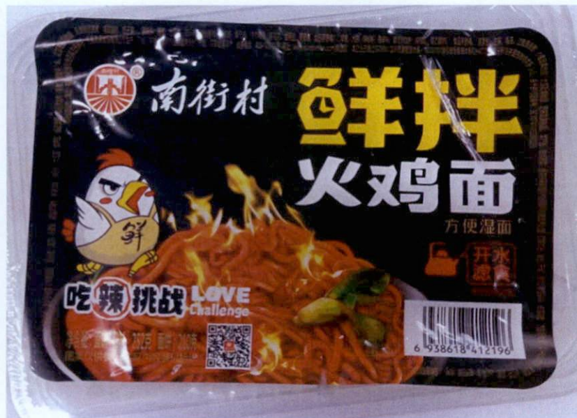
Figure 1. Unregistered Noodles with Black Label in Rectangular Clear Plastic Container (In Foreign Language)

The Food and Drug Administration (FDA) warns all healthcare professionals and the general public NOT TO PURCHASE AND CONSUME the following unregistered food products: