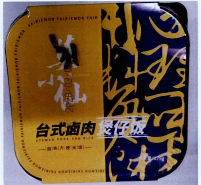
Figure 3. Unregistered FAIRIEMOR Stewed Pork and Rice (In Foreign Language)