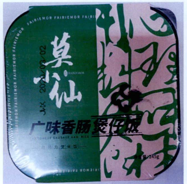
Figure 5. Unregistered FAIRIEMOR Cantonese Sausage and Rice (In Foreign Language)