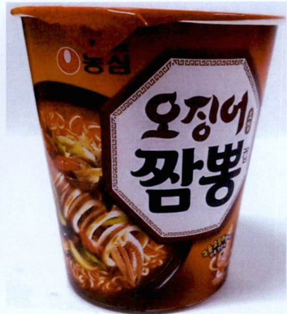
Figure 3. Unregistered Cup Noodles Spicy Squid Flavor in Red and Brown Packaging (In Foreign Language)