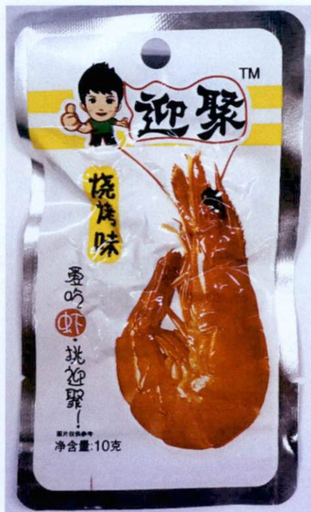
Figure 4. Unregistered Vacuumed Pouch in White and Yellow Packaging with Shrimp Image (In Foreign Language)