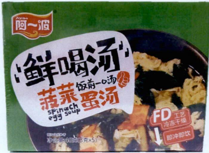
Figure 2. Unregistered AVIBO Spinach Egg Soup in Green Box Packaging (In Foreign Language)