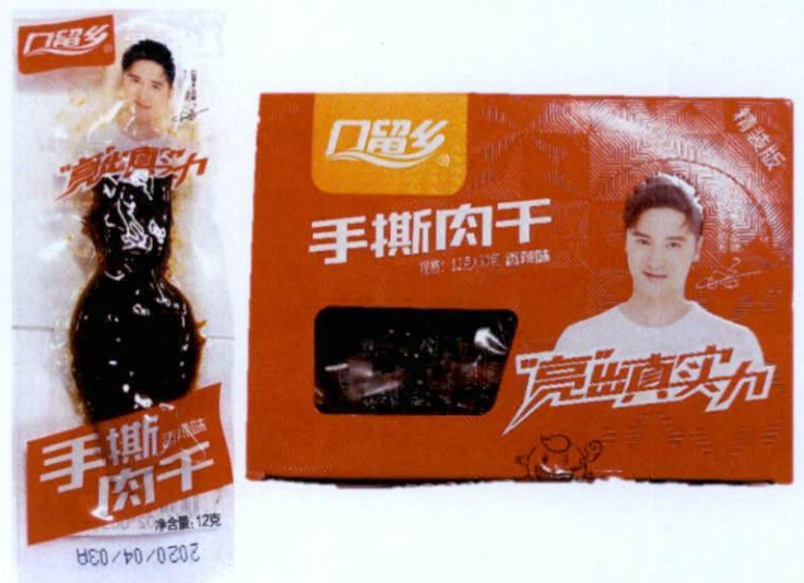
Figure 5. Unregistered Meat Like Product Inside a Red Box Packaging 12x30 (In Foreign Language)