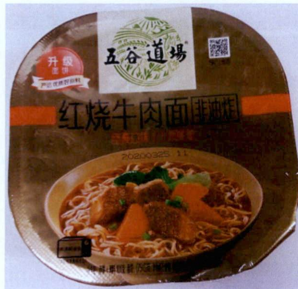
Figure 1. Unregistered Instant Noodles in Black Square Shaped Container with Gold Colored Label (In Foreign Language)

The Food and Drug Administration (FDA) warns all healthcare professionals and the general public NOT TO PURCHASE AND CONSUME the following unregistered food products: