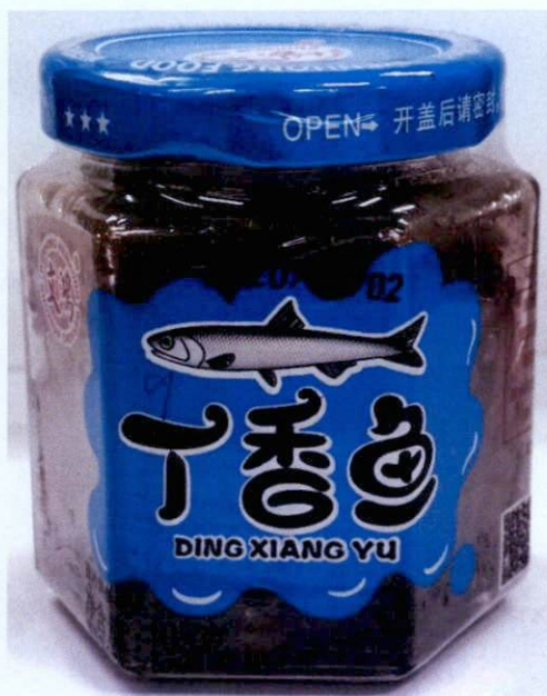
Figure 4. Unregistered DING XIANG YU Glass Bottle with Blue Label with Image of Fish (In Foreign Language)