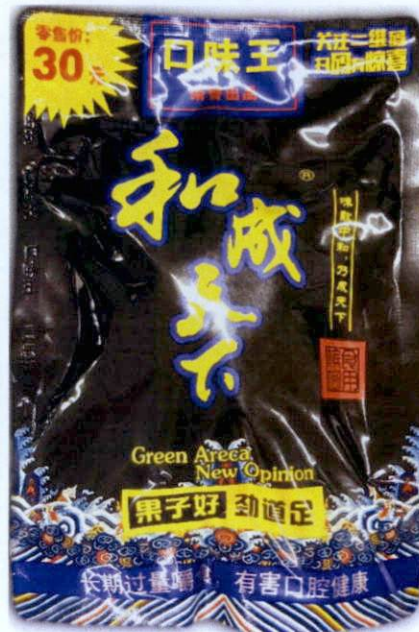
Figure 1. Unregistered GREEN ARECA NEW OPINION in Black and Violet Foil Packaging (In Foreign Language)

The Food and Drug Administration (FDA) warns all healthcare professionals and the general public NOT TO PURCHASE AND CONSUME the following unregistered food products: