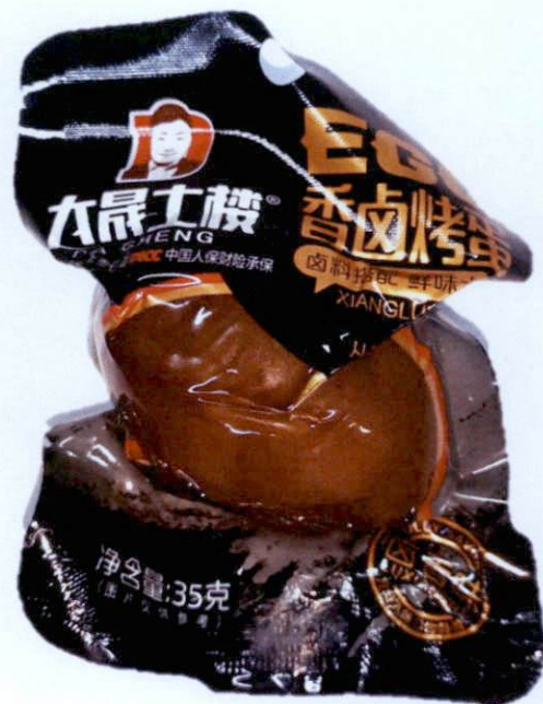
Figure 5. Unregistered DA CHENG Egg in a Vacuumed Pouch With Black Packaging (In Foreign Language)