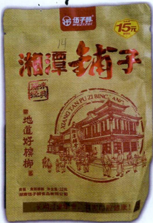
Figure 2. Unregistered XIANGTAN PU ZI BINC ANG With Yellow Foil Packaging (In Foreign Language)