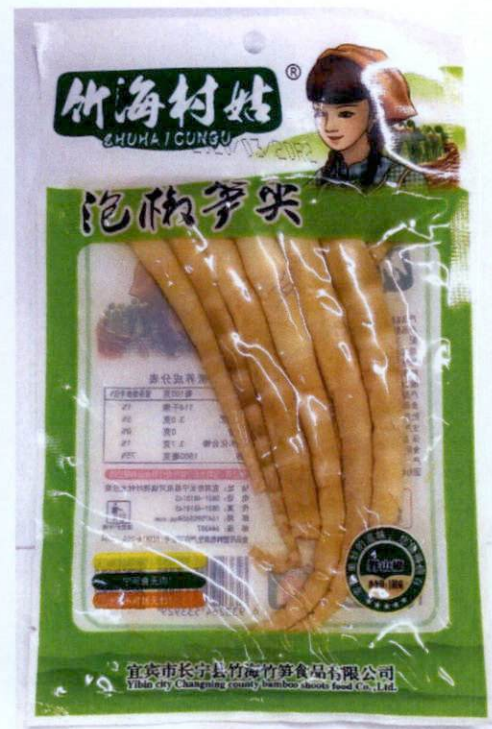
Figure 3. Unregistered ZHUHAI CUNGU Bamboo Shoots (In Foreign Language)