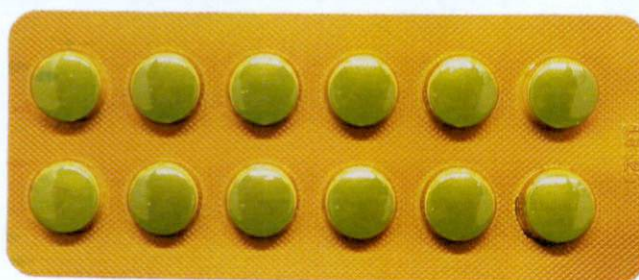
OTC Qing Huo Pian by: Huluwa Pharmaceutical Group