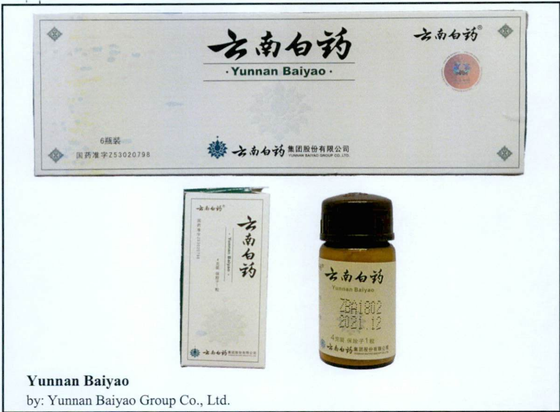
Figure 4. Unregistered drug product