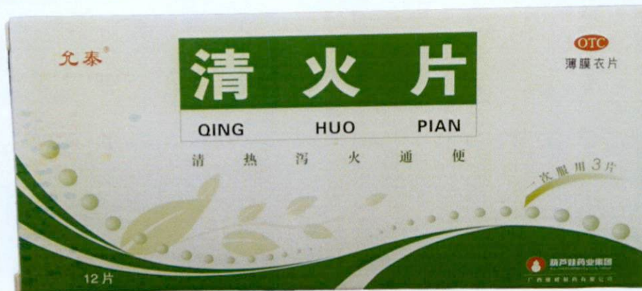
Figure 2. Unregistered drug product