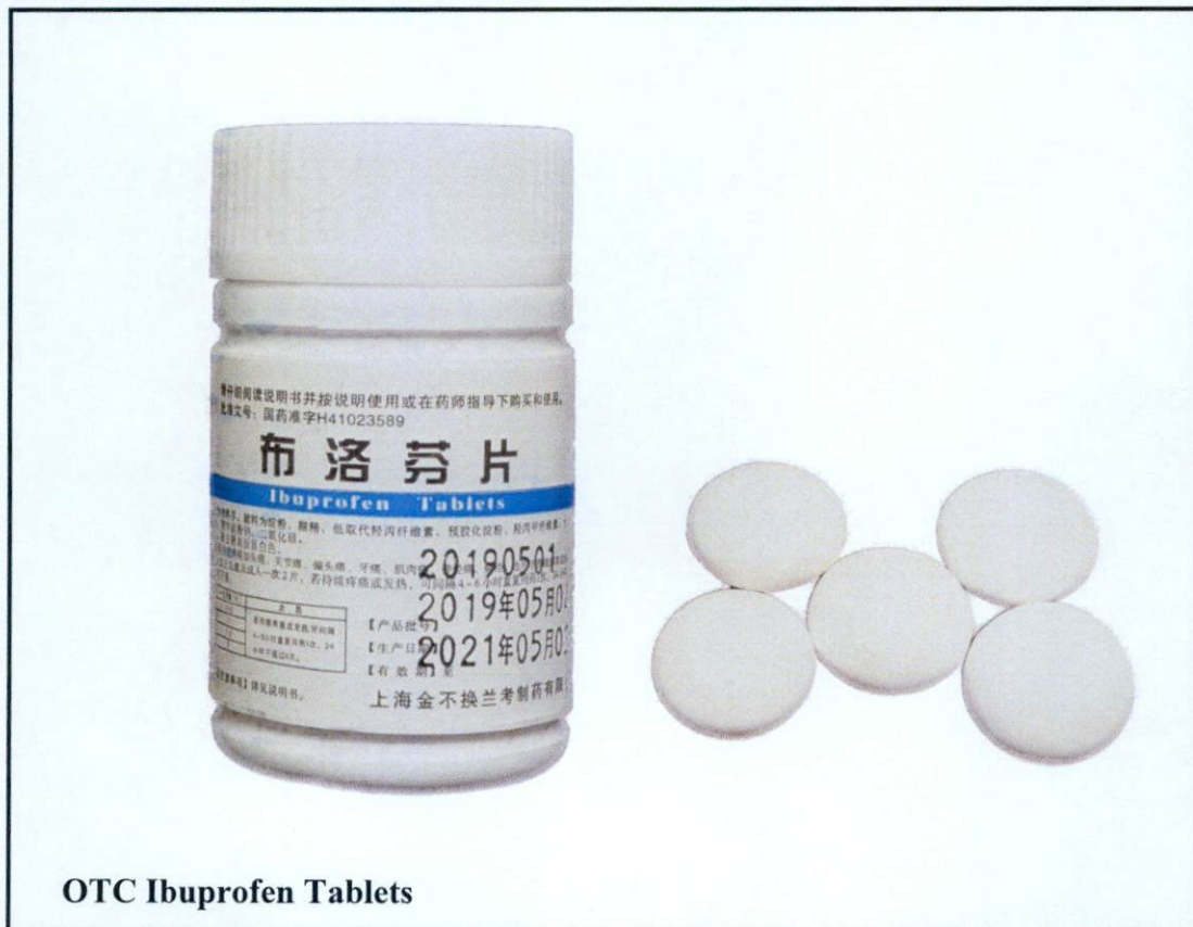
OTC Ibuprofen Tablets

The Food and Drug Administration (FDA) advises the public against the purchase and use of the following unregistered drug products: