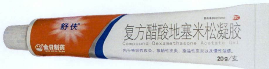
OTC Compound Dexamethasone Acetate Gel by: Golden Sun