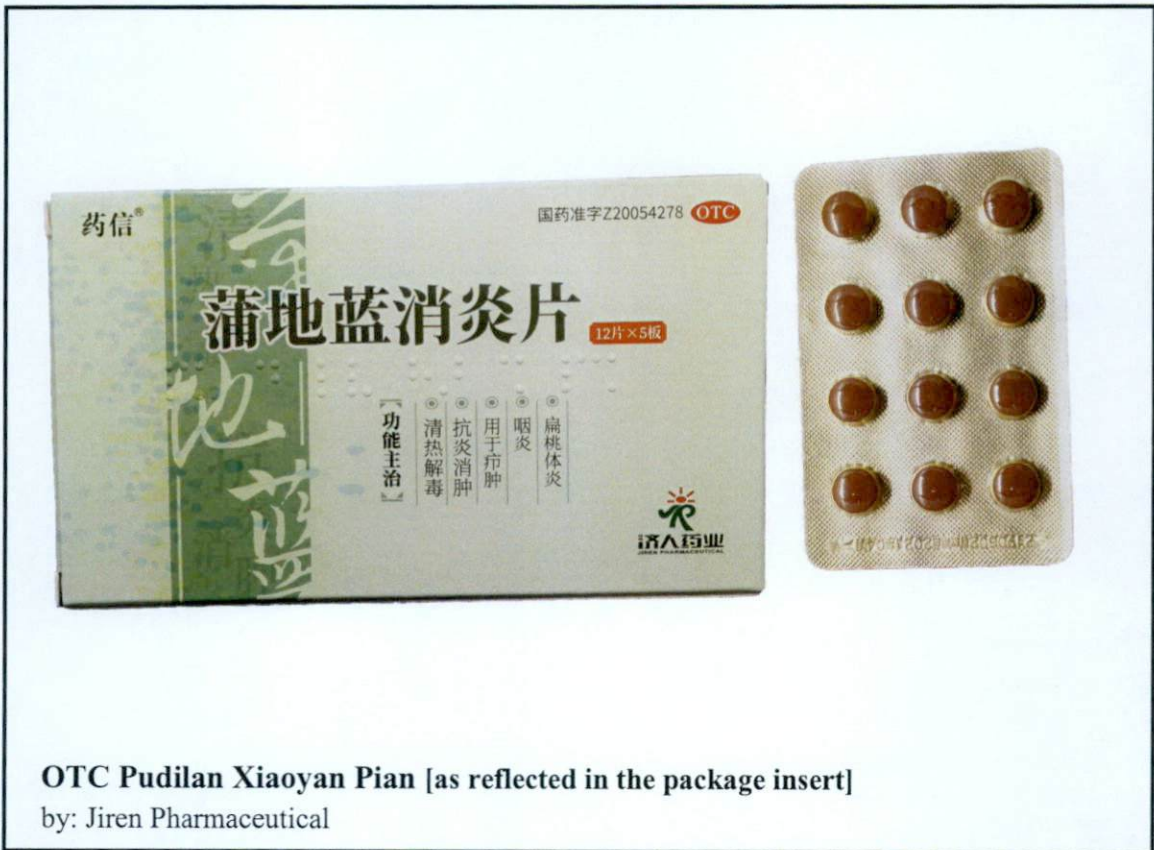
Figure 5. Unregistered drug product