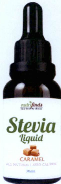
Figure 3. Unregistered NUTRIFINDS Stevia Liquid – Caramel