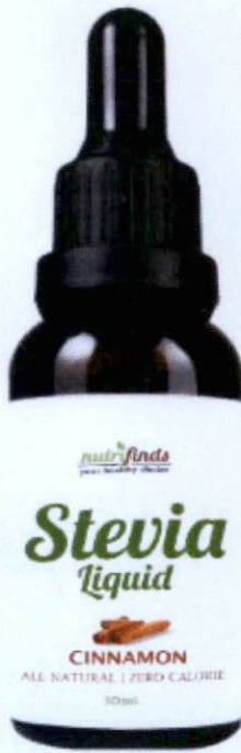
Figure 2. Unregistered NUTRIFINDS Stevia Liquid – Cinnamon