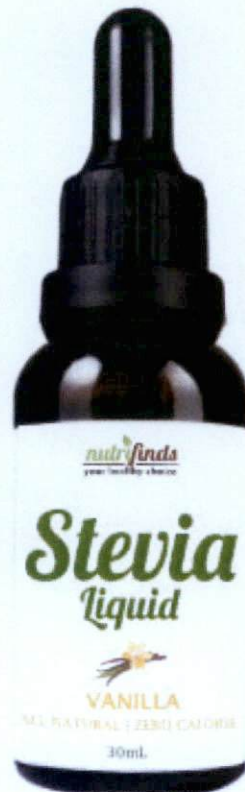
Figure 1. Unregistered NUTRIFINDS Stevia Liquid – Vanilla

The Food and Drug Administration (FDA) warns all healthcare professionals and the general public NOT TO PURCHASE AND CONSUME the following unregistered food products: