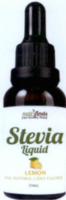
Figure 5. Unregistered NUTRIFINDS Stevia Liquid – Lemon

The FDA verified through post-marketing surveillance that the abovementioned food products are not registered and no corresponding Certificates of Product Registration (CPR) have been